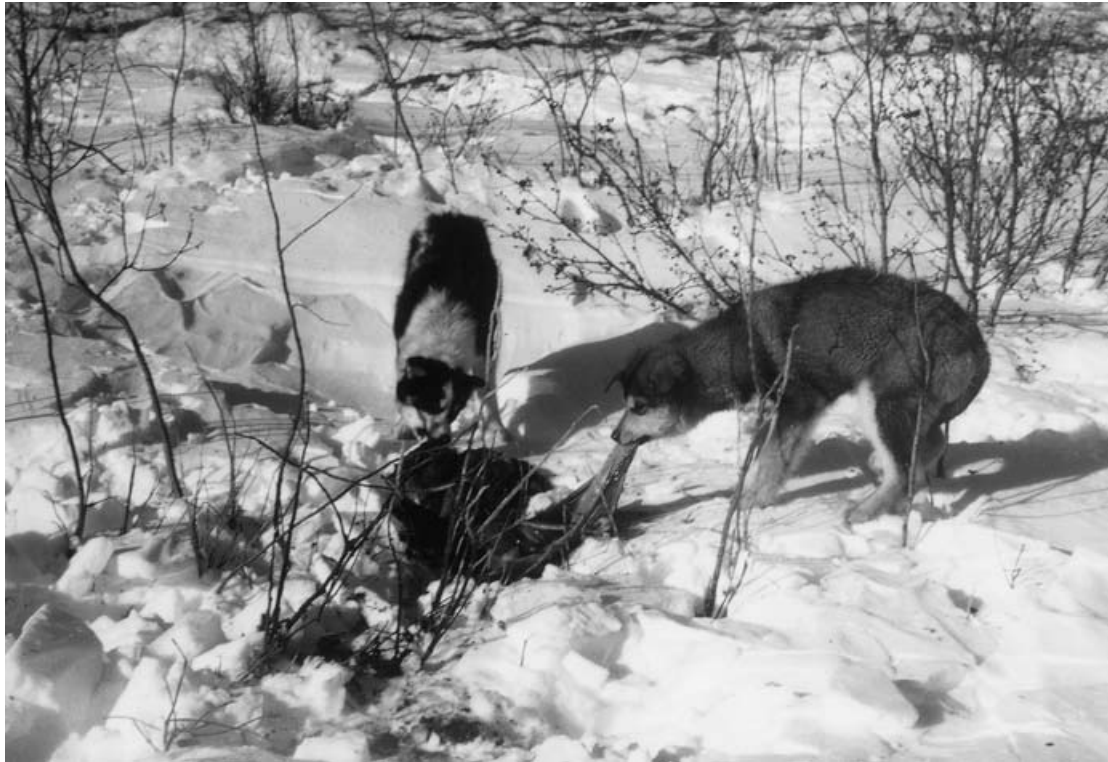
Fig. 4. Young dogs consuming the discarded viscera of a wild reindeer.

(C. Hanns, personal communication). There is no indication that echinococcosis occurs there at present; the village, now with modern facilities, has a population of approximately 300 people.