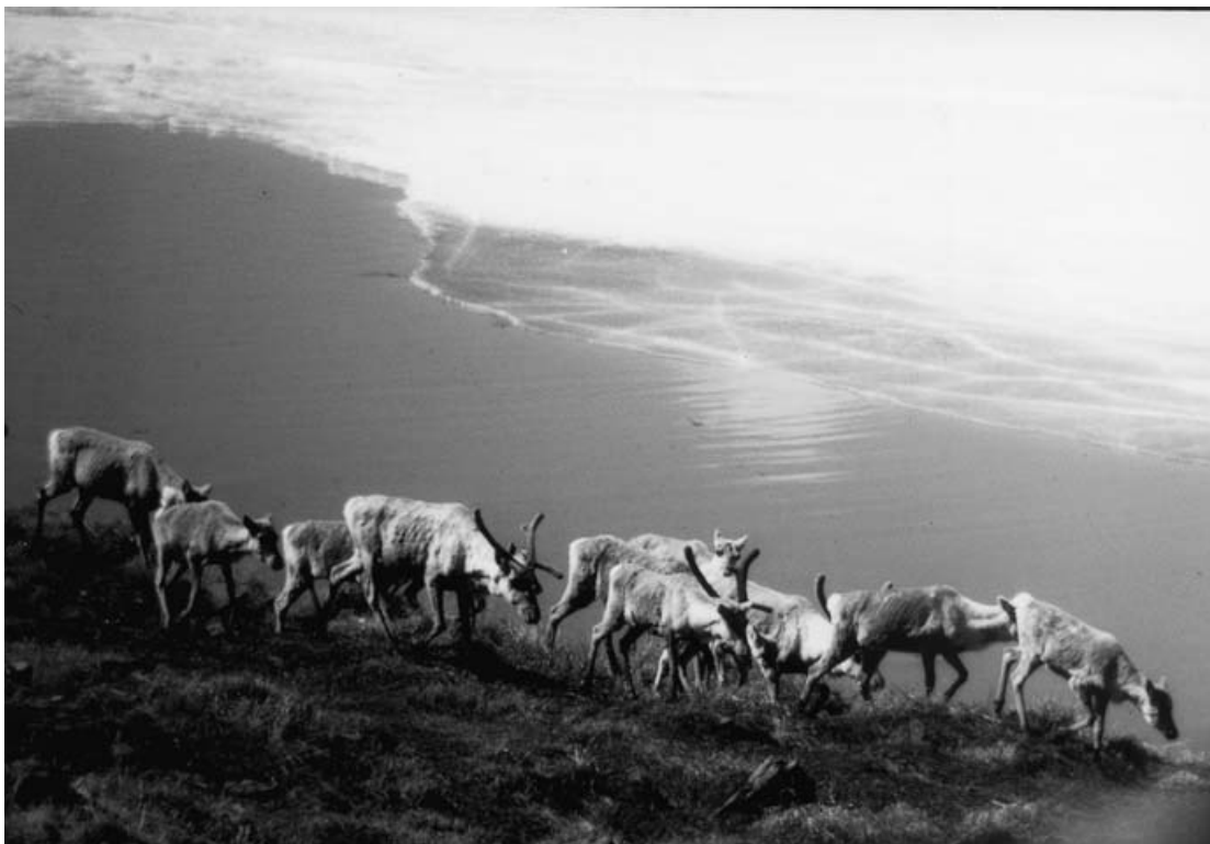
Fig. 2. Wild reindeer, mature males and younger animals, migrating northward along the eastern shore of Chandler Lake, in the central Brooks Range, late May.

likely to have disorders that hamper locomotion, they are most vulnerable to predation by wolves. They also have a higher rate of infection by the