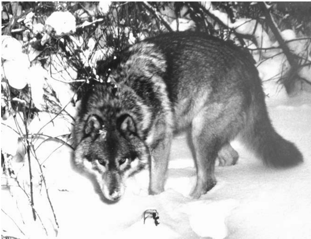
Fig. 1. Wolf, Canis lupus , from south-central Alaska.