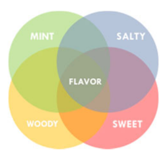
Figure 3. Flavor experiences are realized by olfactory and gustatory experiences.

When you have a flavor experience, are you in a position to identify its gustatory and olfactory realizers? Consider, for example, the flavor experiences induced by 'ripe mangoes, fresh figs, lemon, cantaloupe melon, raspberries . . . green olives, ripe persimmon, onion, caraway, parsnip, peppermint, aniseed, cinnamon, fresh salmon' (see Sibley [2006] for even more examples of flavors). Even careful introspection does not reveal what the phenomenal realizers of those experiences are. In fact, flavor experiences often seem simple and unstructured. This point is well articulated by Smith (2013) when he says that even though flavor perception is multimodal, flavor experiences 'can strike us as whole, unified percepts', and 'on the basis of that phenomenology, we are often unable to distinguish the sensory components that feed into such experiences'.