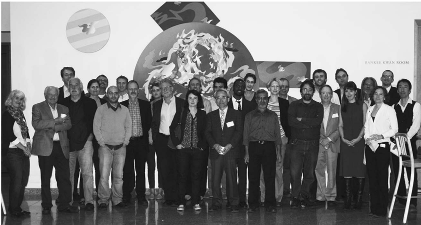
Figure 2. Participants in “The Global E.P. Thompson” conference hosted by the Weatherhead Initiative on Global History and the Program on the Study of Capitalism, Harvard University, October, 2013.

Scholars from most corners of the world responded to our call for papers, interested in assessing the way Thompson’s work was understood, appropriated, given meaning, or in some cases ignored or critiqued in particular national contexts.