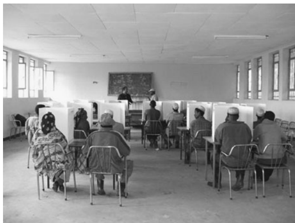
Fig. 2 Typical experiment session

Second, in order to maintain a high degree of experimenter control, particularly over the explanation that was provided to subjects, the following measures were taken as per the norm in laboratory-like experimental sessions conducted in developed countries: (1) one of the authors served as the experimenter and the other author served as the assistant experimenter, (2) the same experimenter and assistant experimenter conducted all sessions and (3) since the experimenter did not speak the subjects' national language, Amharic, all sessions were conducted in English with live translation by a translator who also stayed constant across all sessions. This translator was trained on the protocols prior to the first session. This afforded the authors full control over the explanation of the game protocol that was given to the farmers, and full information on any questions that arose from the subject pool. It also allowed for a meaningful evaluation of subjects' understanding.