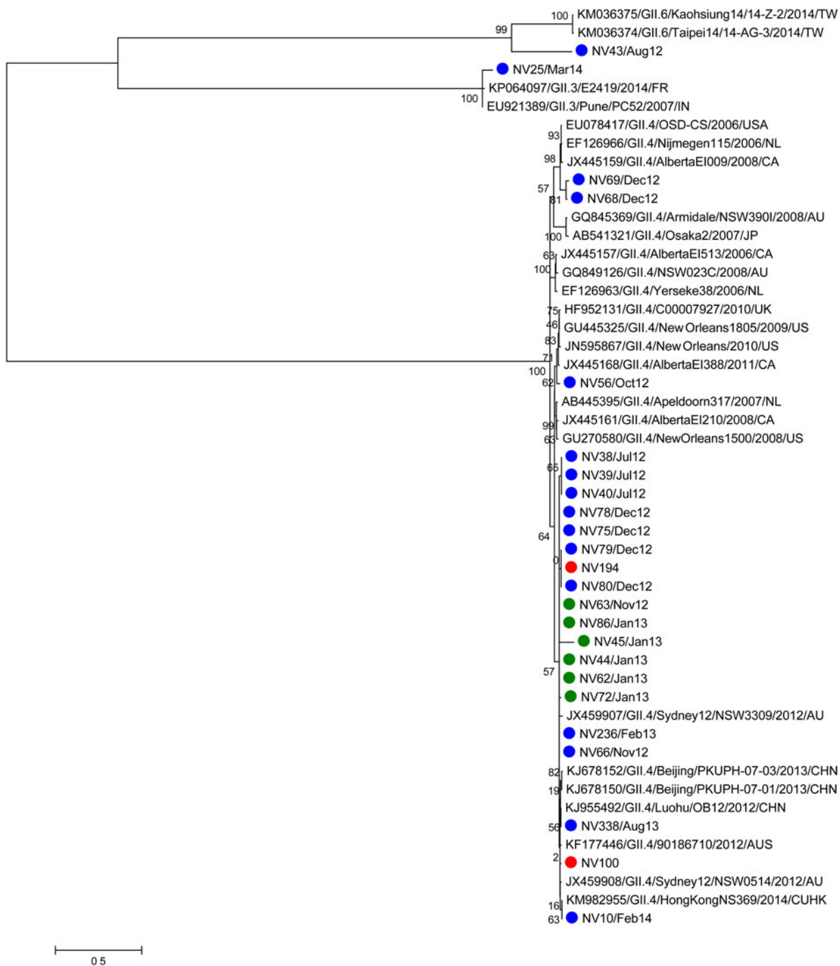
Fig. 2. Phylogenetic analysis of norovirus isolates from the outbreak. Representation of the phylogenetic relationship between outbreak isolates (green dots; food handlers indicated by red dots), community isolates (blue dots), and reference isolates (black text). The diagram shows the tree with the highest log likelihood out of 1000 bootstrapped iterations – the percentage of replicate trees in which the associated taxa clustered together in the bootstrap test is shown next to the branches.

However, it should be noted that not all the cases had consumed food catered by the Chinese banquet kitchen. Fifteen cases who had attended the third event had consumed halal-certified food which was