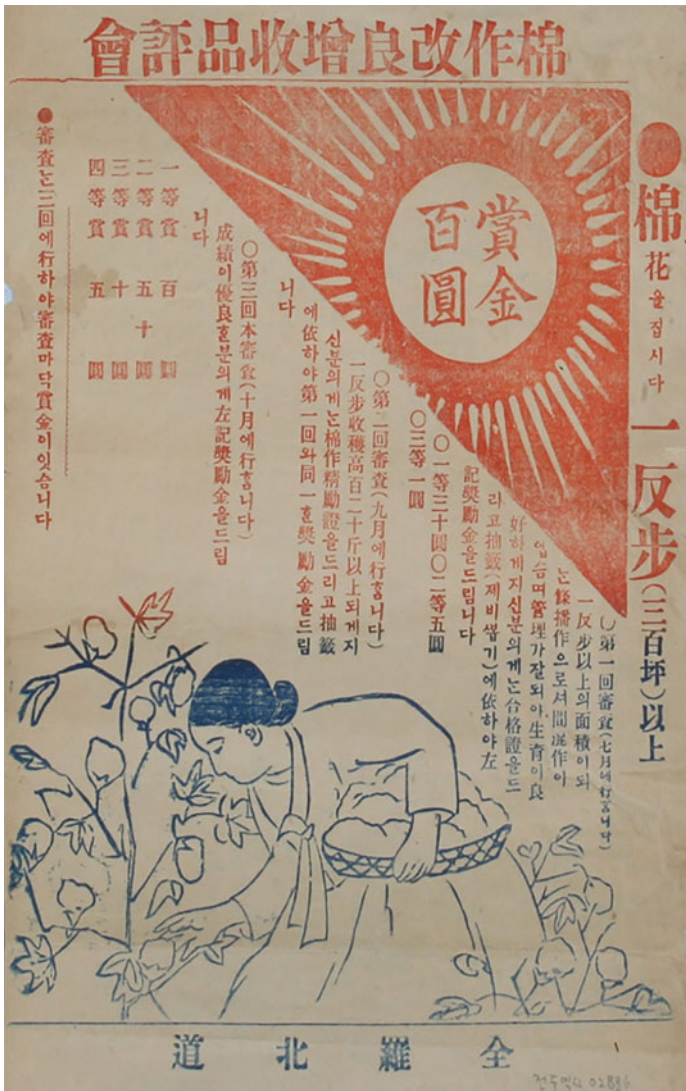
Figure 1. Poster advertising a cotton fair in North Cholla province (n.d.).

in the early years of colonial rule. 54 Though colonial officials would later congratulate themselves for reaching a point where such methods had become ‘unimaginable’, 55 the case from Yönggwang county suggests that in practice the responsibility for coercion and regulation had simply been transferred to the cotton associations and their members. While this shift invited broader participation from the rural population—in this