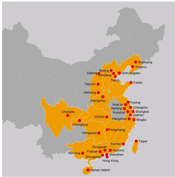
Map 1. Foxconn's Locations in Greater China

Sources: Foxconn Technology Group company websites.