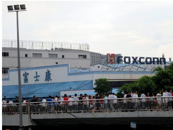
Foxconn workers flood in and out of the Longhua factory in Shenzhen, Guangdong. Hon Hai Precision Industry Company, known by its trade name Foxconn, is headquartered in Taipei.