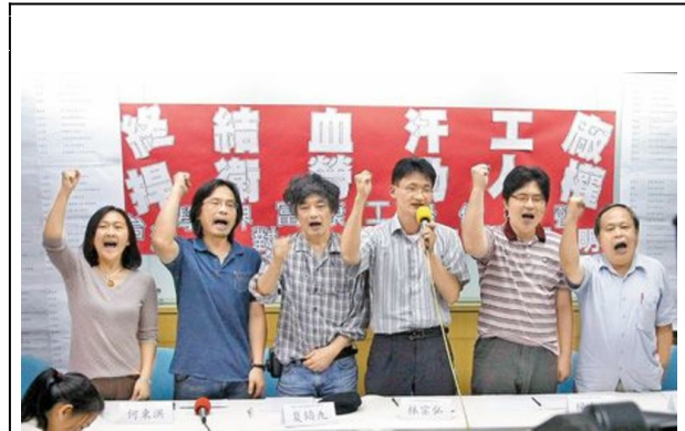
Taiwanese researchers' press conference on 13 June 2010 called on Foxconn: "End to sweatshop" and "Defend labor and human rights."

On the basis of these two open statements linking scholars and students from mainland China, Hong Kong and Taiwan, a large-scale collective investigation of Foxconn was set up in the summer of 2010.