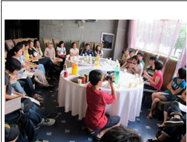
40 students and scholars from Hong Kong, China, and Taiwan take part in research skills training preparatory to conducting fieldwork in Foxconn factories, worker dormitories, and public spaces.

at different hostels and carrying out interviews and surveys in the Longhua and Guanlan industrial communities, where the two mega factories of Foxconn are based.