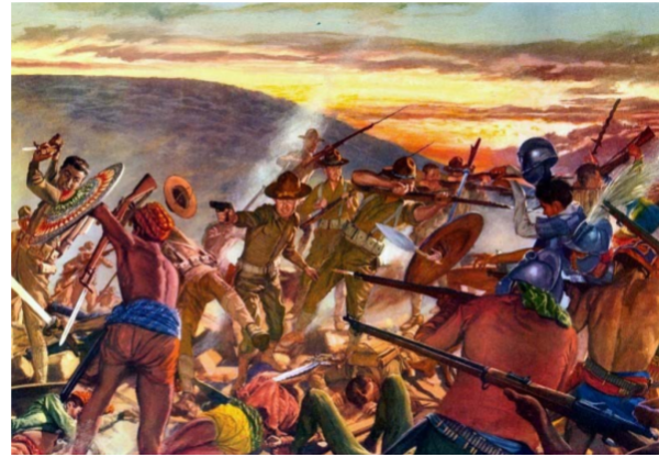
Knocking out the Moros: This romanticized image of American campaigns against the Moros, entitled "Knocking out the Moros: The U. S. Army in Action," was commissioned by the Department of the Army in 1953 as a recruitment poster.