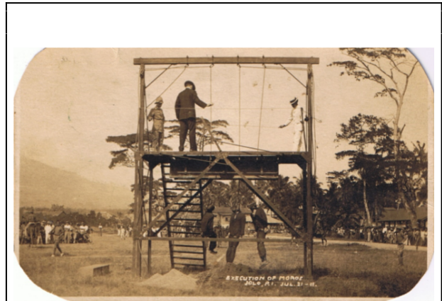
Hanging at a distance: The execution of three Moros in Jolo during Pershing's command in the Southern Philippines, July 21, 1911.