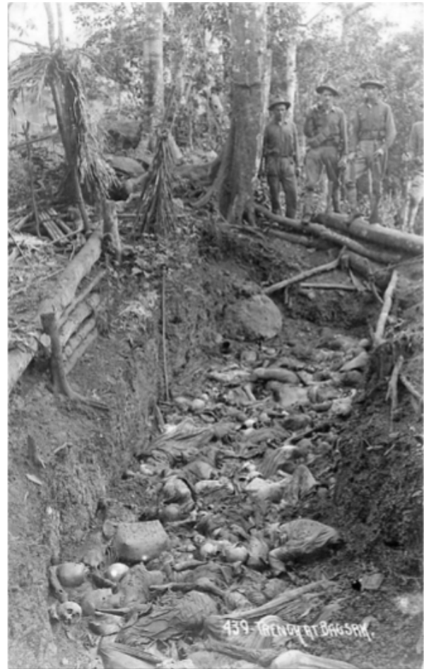
Bagsak trench: A photograph taken of a trench at Bud Bagsak, where Gen. Pershing's forces killed several hundred Moros, including non-combatants.

In the largest sense, the fable is about the ways that propaganda which smells sufficiently like history can preempt a serious wrestling with the past by seizing the place in our collective memory that should be dedicated to events that actually happened. What other actual histories might justifiably take the place in our collective memory currently occupied by this fabricated, mythological one?