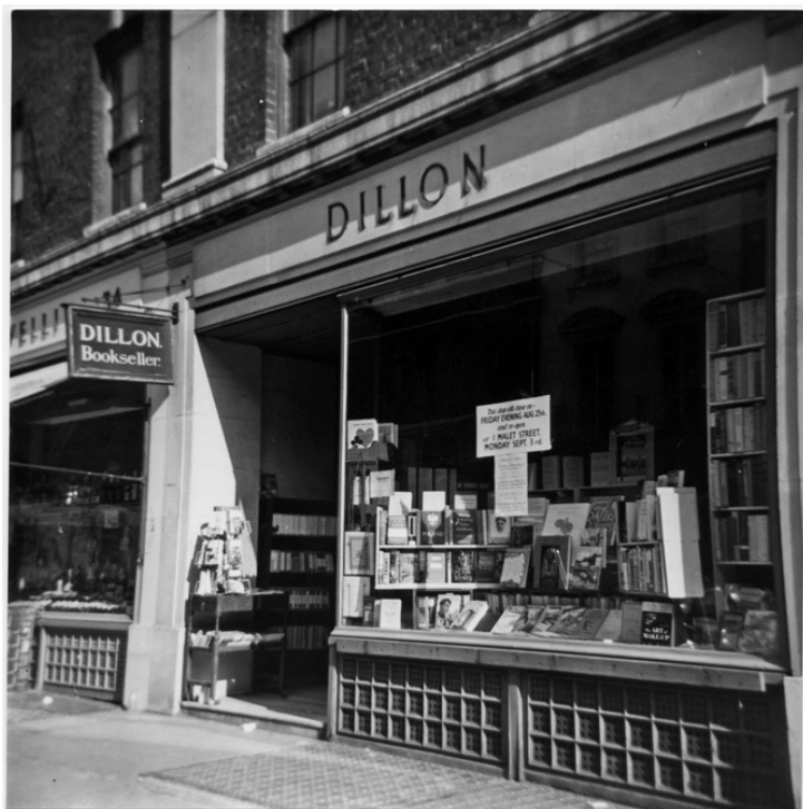
Figure 3 Image of Dillon Bookshop 33 Store Street

support which the shop, and its owner had, and the determination and courage it must have taken to have kept going. Today that space is still a bookshop, Treadwells, an esoteric specialist selling old and new books. 271