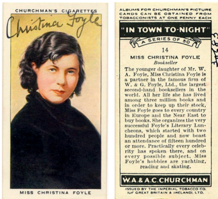
Figure 2 A cigarette card showing Christina Foyle

a celebrity – so much so that she was chosen to appear on a set of cigarette cards (see Figure 2).