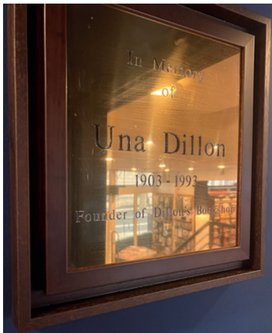
Figure 8 Picture of the reinstated Dillon plaque, taken on 1 May 2024

Booksellers of the past contributed significantly to the cultural and intellectual lives of the people they served: they should not be hidden in the bookshelves of history. They are often, as this Element has hopefully shown, dynamic agents within the communications circuit. The women booksellers, moreover, as this Element proves, should more correctly be known as formidable , using the French term and meaning, rather than formidable in the English sense. True, they did use clothing and accessories to create and support their business personas – but there is not a ravelled cardigan in sight, in any description of the women here. Rather the evidence shows women who were successful at building up their own businesses, and running them during exceptional times. They worked at local, national, and