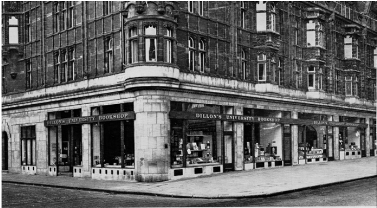
Figure 5 A picture of Dillons University Bookshop

a bookshop of the traditional dark and musty atmosphere would be horrified by Dillon's. It has lightly painted walls and beautiful, soft-coloured Lundia wood shelving. Contemporary light fittings and elegant modern staircases complete the picture of a colourful fresh place in which to peruse books quietly and at leisure. 283