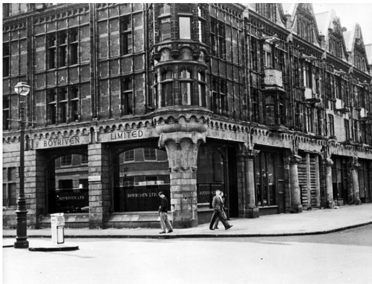
Figure 4 Image of Torrington Place Shops, year unknown