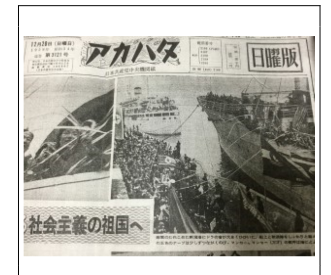
"With Throbbing Hearts, to the Socialist Motherland" Akahata headline, December 20, 1959. On the photos: the first ship leaving Japan on December 14, 1959, with zainichi Koreans being transported to North Korea on board

ours and I understand Okinawans' mood very well, but it looks as if the Japanese do not understand it."