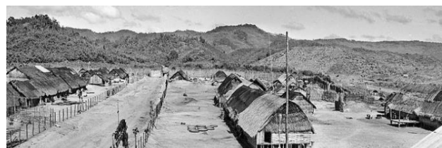
Strategic Hamlet, Vung Tau District,

Elements of Japanese seized hearts methods also recurred in South Vietnamese counterinsurgency in the 1950s and 1960s. In 1961, British managers of the counterinsurgency system in Malaya went to Saigon to consult with President Ngô Đình Diệm on hearts and minds tactics against insurgency in the Republic of Vietnam. From this visit and the subsequent British advisory mission to Sai Gon, several historians have concluded that South Vietnamese hearts and minds counterinsurgency, which included clearance, hold, protection, and persuasion of population relocated into new fortified villages, known now as strategic hamlets, was a direct descendant of British hearts and minds counterinsurgency in Malaya. However, President Diệm and his senior advisors had their own ideas about hearts and minds counterinsurgency well before the British mission arrived in Sai Gon. 55 There is reason to think that Diệm was probably aware of Japanese seized hearts counterinsurgency well before he became prime minister of the State of Vietnam in 1954 and then president of the Republic of Vietnam in 1955. As a nationalist and anti-Communist, Diệm felt a sense of alliance with some of the political elements of the Imperial Japanese Army and Japanese diplomatic mission in French Indochina in the early 1940s, men who were vigorously opposed to Communism, committed to some form of independence for Vietnam, and under orders to persuade Vietnamese to cooperate with the Empire of Japan. 56