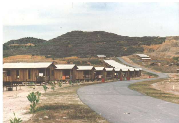
A FELDA resettlement village, Pahang, Malaysia 1970s

After merdeka in 1957 and final creation of Malaysia (without Singapore) in 1959, the Malay managers of the new state also thought so highly of the New Village program that they recreated elements of it as a way of regulating Malaysia and making it more legible as a modern state. Until its conversion into a state manager of agribusiness in 1991, the Federal Land Development Authority (FELDA) created, administered and managed a vast relocation and resettlement scheme in peninsular Malaysia.