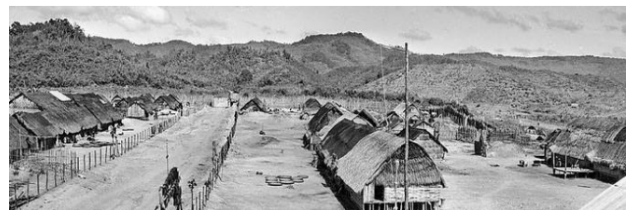
Strategic Hamlet, Vung Tau District,

Elements of Japanese seized hearts methods also recurred in South Vietnamese counterinsurgency in the 1950s and 1960s. In 1961, British managers of the counterinsurgency system in Malaya went to Saigon to consult with President Ngô Đình Diệm on hearts and minds tactics against insurgency in the Republic of Vietnam. From this visit and the subsequent British advisory mission to Sai Gon, several historians have concluded that South Vietnamese hearts and minds counterinsurgency, which included clearance, hold, protection, and persuasion of population relocated into new fortified villages, known now as strategic hamlets, was a direct descendant of British hearts and minds counterinsurgency in Malaya. However, President Diệm and his senior advisors had their own ideas about hearts and minds counterinsurgency well before the British mission arrived in Sai Gon. 55 There is reason to think that Diệm was probably aware of Japanese seized hearts counterinsurgency well before he became prime minister of the State of Vietnam in 1954 and then president of the Republic of Vietnam in 1955. As a nationalist and anti-Communist, Diệm felt a sense of alliance with some of the political elements of the Imperial Japanese Army and Japanese diplomatic mission in French Indochina in the early 1940s, men who were vigorously opposed to Communism, committed to some form of independence for Vietnam, and under orders to persuade Vietnamese to cooperate with the Empire of Japan. 56