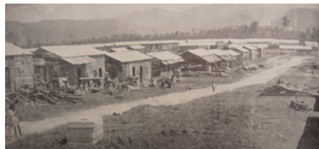
Jinjang New Village, Malaya, 1950s.

attack British colonialism in Malaya and to prevent eventual independence from total domination by the Malaya majority. After approximately two years of violent but ineffective attempts to put down the insurgency, the British adopted clear, hold, protect, and persuade strategy aimed directly at the Chinese population who were removed to fortified "New Villages" where British managers of the British Empire in Malaya and their Malay cohort subjected them to political proselytization, self-policing, and reward for compliance with some of the social and economic goods of modernity, especially schools, health care, safety, and support for small business. 40 By 1958, more than 763,000 Chinese-Malayans (12 percent of the total Malaya population) lived in 582 fortified and heavily controlled protection villages. 41 The program was devised by General Sir Harold Briggs and implemented by General Gerald Templer.