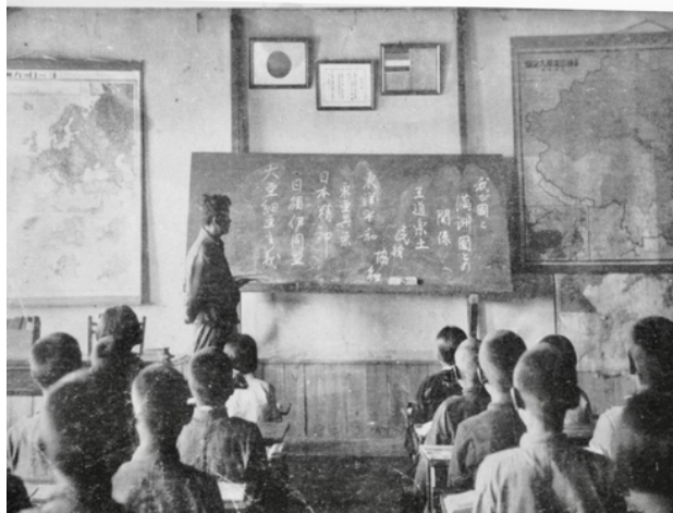
Japanese education in a Manchukuo protection village for Koreans, 1942

collective villages with a total population of more than 5.5 million Koreans, Chinese, and Manchus dotted the remoter regions of Manchukuo. More than 2,500 new villages were slated for construction in 1938. 21