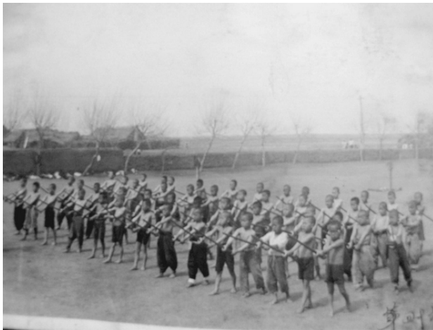
Military training for children living at a Japanese protection village in Manchukuo. Source: Piao Renzhe, 'Manshū' ni okeru Chōsenjin 'Anzen nōson' ni kansuru ikkōsatsu [A study of Korean protection villages in Manchuria], Hokkaidō University Graduate School of Education Research Bulletin, Vol. 106, pp. 103-117.

cultivate land owned by the pre-Japanese Yi state and/or the pre-Japanese elite. 13 But in Manchuria, Koreans faced both formal and informal discrimination from Chinese authorities and Chinese neighbors. As well, the Japanese consular police in Manchuria and the Japanese Government-General of Korea across the border viewed Koreans in Manchuria as potential insurgents against Japanese rule in Korea and Japanese interests in Manchuria. Korean nationalist organizations operated in the area, notably, the Northeast Anti-Japanese United Army, which included Kim Il Sung and others who would eventually found the post-1945 North Korean state. 14 There had been a Korean armed uprising in Jiandao in 1930 15 followed by increased anti-Japanese sentiments and insurgent activity in the Korean districts of Manchuria and elsewhere concomitant with the Japanese conquest of all of Manchuria and establishment of the Manchukuo client state in 1931-1932. 16