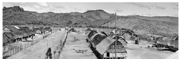
Strategic Hamlet, Vung Tau District,

Elements of Japanese seized hearts methods also recurred in South Vietnamese counterinsurgency in the 1950s and 1960s. In 1961, British managers of the counterinsurgency system in Malaya went to Saigon to consult with President Ngô Đình Diệm on hearts and minds tactics against insurgency in the Republic of Vietnam. From this visit and the subsequent British advisory mission to Sai Gon, several historians have concluded that South Vietnamese hearts and minds counterinsurgency, which included clearance, hold, protection, and persuasion of population relocated into new fortified villages, known now as strategic hamlets, was a direct descendant of British hearts and minds counterinsurgency in Malaya. However, President Diệm and his senior advisors had their own ideas about hearts and minds counterinsurgency well before the British mission arrived in Sai Gon. 55 There is reason to think that Diệm was probably aware of Japanese seized hearts counterinsurgency well before he became prime minister of the State of Vietnam in 1954 and then president of the Republic of Vietnam in 1955. As a nationalist and anti-Communist, Diệm felt a sense of alliance with some of the political elements of the Imperial Japanese Army and Japanese diplomatic mission in French Indochina in the early 1940s, men who were vigorously opposed to Communism, committed to some form of independence for Vietnam, and under orders to persuade Vietnamese to cooperate with the Empire of Japan. 56