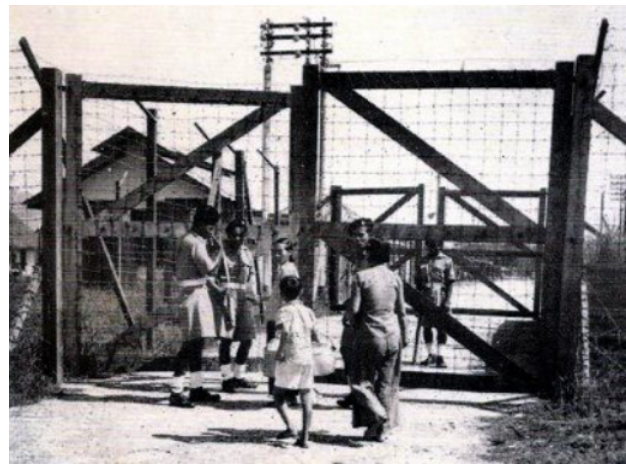
Security gates at a New Village, 1950s, Malaya.

and over the course of several secret meetings with representatives of the Malayan People's Anti-Japanese Army in 1943 and 1944, collected comprehensive intelligence about imperial Japanese counterinsurgency strategies, including evidence that seized hearts tactics were effective in countering the activities of the Malayan People's Anti-Japanese Army. SOE intelligence on Japanese operations in Malaya then went to British South East Asia Command, to London and New Delhi, and was available to the British after they re-occupied Singapore and Malaya. 45