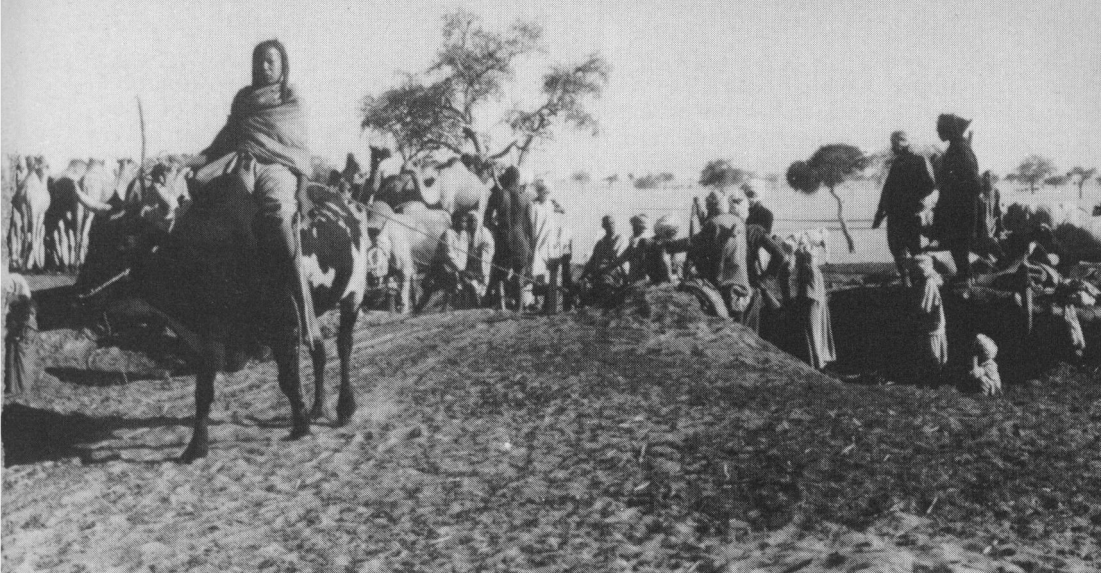
At the well

traditional hunting methods are not doing damage today. If modern methods had not threatened the survival of so many species, traditional hunting would obviously have much less effect; but now that they are depleted the sooner all forms of irrational hunting stops, the quicker they will be able to recover. In a country like Chad, which has few presently exploitable mineral or petro-chemical resources, vehicles and firearms have had less impact. But the nomads' life has changed too: thirty years ago a horse was a real luxury; today virtually every nomad family possesses at least one, increasing both the amount of hunting and its effectiveness.