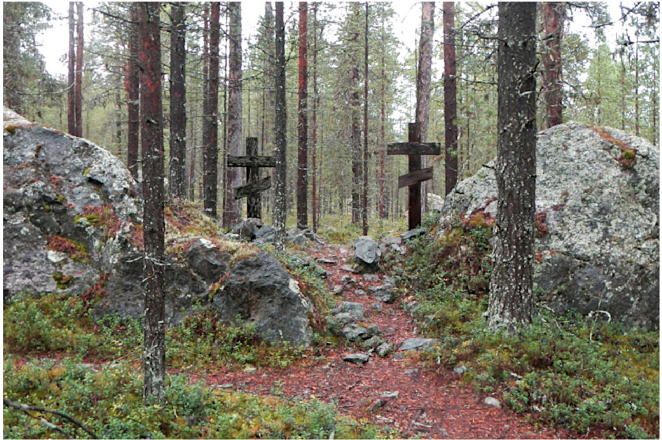
Figure 9. Orthodox crosses in a gate-like setting on both sides of a path leading to a PoW mass grave on the boundary of a PoW camp at Inari Martinkotajärvi.

sites and their impact on people need to be understood. These sites with their various materially and perceptually ‘strange’ features can stir up ‘existential’ reflections about people’s relationship with the surrounding world, as well as the relationships between the past, present and future, as exemplified by the haunting experience of our volunteers at Kankiniemi. The elusive ruins of German sites bring the wartime and its many troubling legacies close to people and force them to face the past in an unmediated manner. This is, conceivably, an important reason why they provide a suitable and powerful ‘infrastructure of haunting’ (Holloway 2010), and thus provoke ghostly experiences and narratives in a landscape that is historically, culturally and experientially ‘fit’ for such experiences.