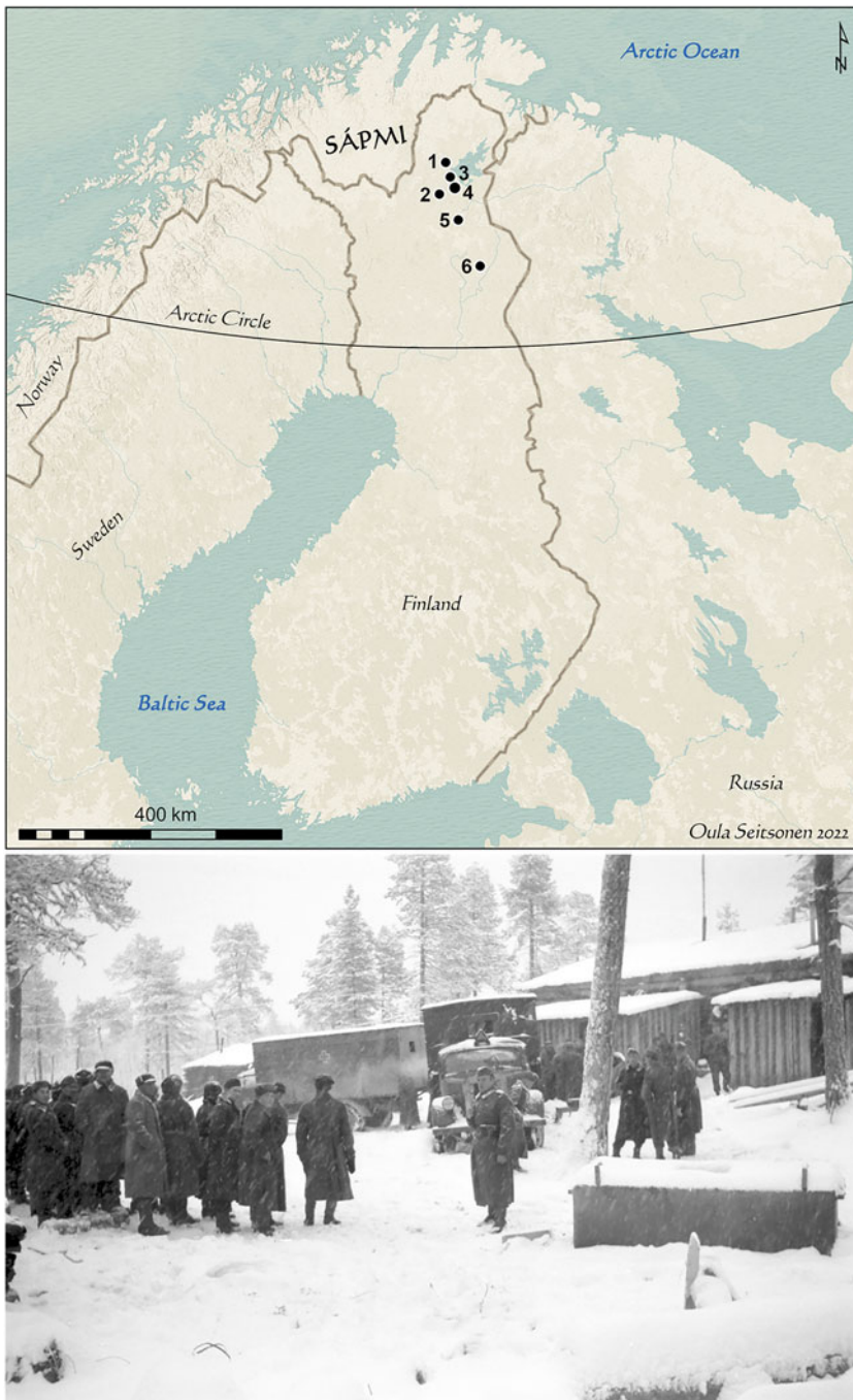
Figure 1. Top: Multinational Sápmi and the discussed sites in northern Finland. (1) Inari Hyljelahti; (2) Inari Haukkapesäoja; (3) Inari Kankiniemi; (4) Inari Martinkotajärvi; (5) Sodankylä Kopsusjärvi; (6) Savukoski Seitajärvi. (Background map: Esri.) Bottom: Soviet Prisoners of War (on the left) outside their log house with German guards (on the right) at Inari Haukkapesäoja, Lapland.

are still very much in the margins of both the research and the grand narratives of modern war. 1 Nonetheless, there are indications that superstitions, with their material/talismanic expressions, abounded also during WWII, as illustrated by MacKenzie’s (2015; 2017; see also Gregory 2019) research on superstition as a means of coping with the constant threat of death. Recent work in Finland has indicated that premonitions and other strange (‘supernatural’) experiences were common among Finns both on