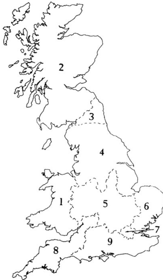
Key to numbered sections of Part I (Sites Explored).