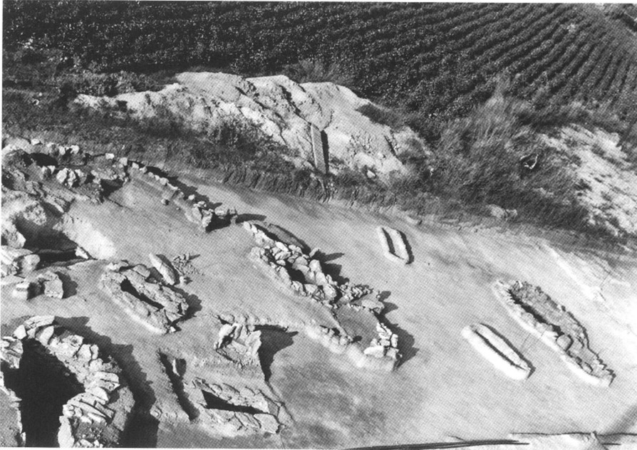
Fig. 8.3. Platanos Almyrou, Halos. Iron Age necropolis.

A study by Courtney McConnan-Borstad and colleagues (2018) is noteworthy for its examination of the impact of natural events on dietary patterns. The study investigated dietary trends from the Hellenistic to Byzantine period in Helike to determine if meat restrictions that applied during fasting days in the Byzantine period could be detected isotopically. Although the meat restrictions would be expected to result in higher fish consumption in Byzantine times, the stable carbon and nitrogen isotope results revealed that the diet of Byzantine period individuals actually contained fewer marine resources compared to those in the Hellenistic period. Similarly, Roman diet was based on terrestrial resources with limited marine inputs. The authors suggest that these temporal trends may not reflect cultural practices, but they may instead be linked to a lagoon that formed after the 373 BC earthquake, facilitating access to aquatic resources temporarily.