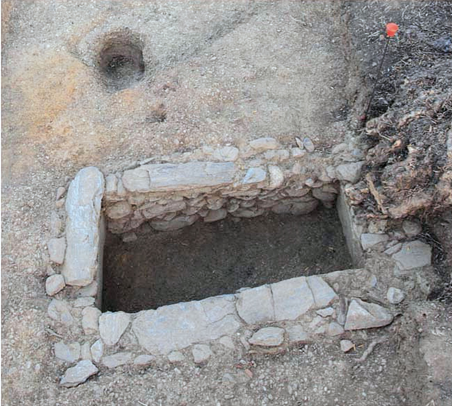
Fig. 8.5. Agios Vasilios. Cist grave Tomb 23 and the pit for infant burials.

Furthermore, the mortuary practices gradually evolved to encompass different forms of secondary treatment of the deceased (e.g. skeletal disarticulation, commingling, and relocation), which may emphasize broader concepts of lineage and descent. In parallel, the co-existence of various burial practices (e.g. contracted and extended burials, intramural and extramural graves, small pits and large cists) suggested tensions between tradition and innovation as well as integration and differentiation. It is also important to mention Ioanna Moutafi's (2021) study on funerary practices and their social implications in Mycenaean Voudeni , Achaea. This research showed that the association between social change and mortuary practices is often reflected in subtle shifts in the treatment of the deceased.