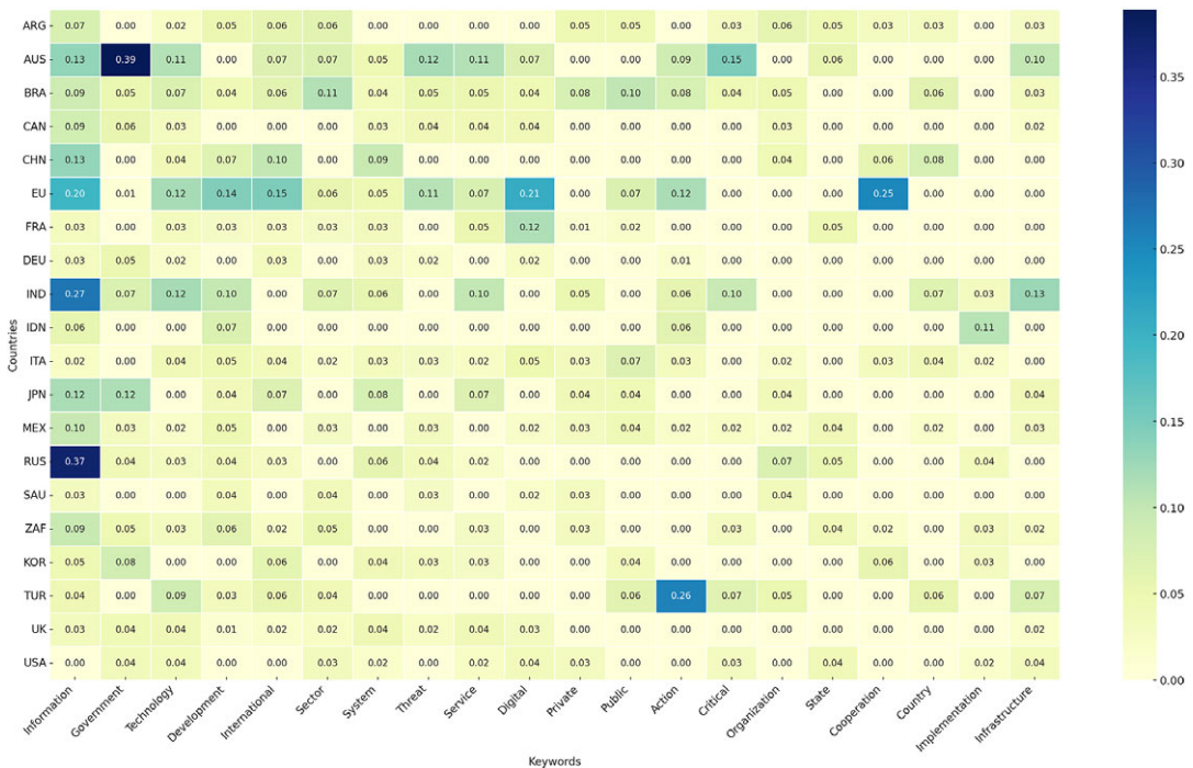
Figure 2. Heatmap of Top 20 keywords weights by country.

The presence of ‘Action’, ‘Critical’, ‘Organization’, and ‘State’ in six strategies might show a focus on active measures to protect critical infrastructure and organizational assets. Additionally, the presence of ‘Cooperation’, ‘Country’, ‘Implementation’, ‘Infrastructure’, and ‘Support’ in five countries’ strategies may reflect a desire for implementation and support of cybersecurity infrastructure through cooperative efforts.