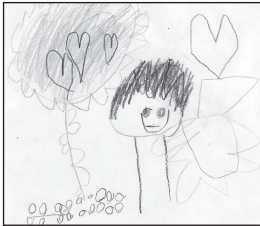
FIGURE 2: Wastewise drawing showing the student “looking after the worms” (Pre-primary boy)

Student numbers: Pre primary 15; Lower primary 21; Upper primary 18; Total 54.