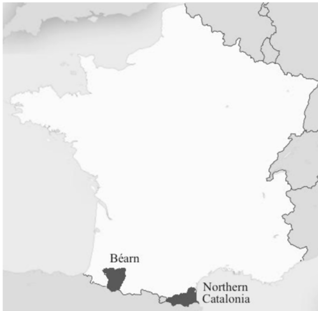
Figure 3. Areas of study (adapted from Wikimedia Commons user Giro270)

Pyrenean Lengadocian is identified as ‘le “pont” naturel entre gascon et catalan’ (Bec, 1973: 19), but the rest of the Lengadocian dialect is singled out as particularly conservative, emphasizing the structural parallels between the Gascon dialect and Catalan.