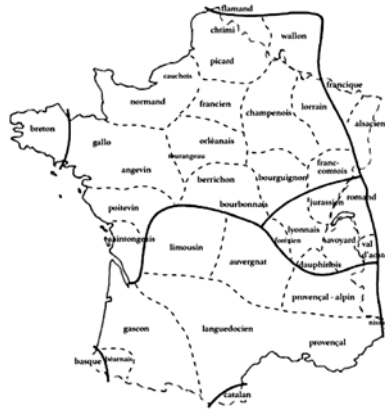
Figure 2. Gallo-Romance dialect areas (Mooney, 2016: 9)

six main dialects (Bec, 1963:37; see Figure 2), with Gascon in the southwest, including the Béarnais sub-dialect (the focus of the present study).