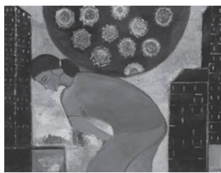
Title: Oversized, Overwhelming Impact of COVID-19, 2020

Beginning with volume 43 (January 2022), the cover of Infection Control & Hospital Epidemiology (ICHE) will feature art inspired by or reflective of topics within the scope of the journal and their impact on patients, healthcare personnel and our society. These topics include healthcare-associated infections, antimicrobial resistance, and healthcare epidemiology. The intent is to feature original artwork that has been created by individuals who have a personal connection to one or more of these topics through their clinical work, research, or experience as a patient or an affected patient's family member, friend or advocate. The goal is to provide readers with a visual reminder of the human impact of the topics addressed in the journal and the importance of the work being done by those who read or contribute to ICHE and by all who are trying to make healthcare safer through the elimination of healthcare-associated infections.