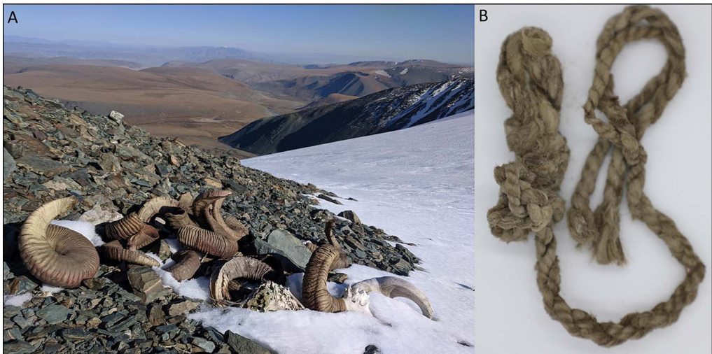
Figure 3. A) Argali sheep remains emerge from a melting glacier at Tsengel Khairkha, western Mongolia, a site that has yielded evidence of high-altitude hunting over more than three millennia; B) an animal-hair (horse or camel) rope artefact from an ice patch near Tsengel Khairkhan, radiocarbon dated to the fifth to sixth century AD.

Rising temperatures are also affecting many other global environments. As explored by Gregory and colleagues (2022) and Matthiesen and colleagues (2022) in this special section, the rates of chemical and biological reactions increase with temperature. Thereby, even small changes in soil or sea temperature may significantly increase the degradation and corrosion rates of archaeological materials (Björdal & Gregory 2012; Macleod 2013; Hollesen & Matthiesen 2015). Rising temperatures may also indirectly lead to changes in flora and fauna, and introduce invasive species that can cause damage to archaeological materials (Borges et al. 2014; Matthiesen et al. 2020).