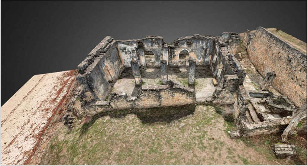
Figure 4. 3D model of the Malindi Mosque, Kilwa Kisiwani, Tanzania. Sea-level rise and loss of mangroves, which act as a buffer to the sea, have resulted in the site experiencing loss of the seaward side of the monument.

necessary to adapt to climate change. This approach is further exemplified by the National Landmarks at Risk publication (Holz et al. 2014), which was aimed at the US population at a time of great climate scepticism.