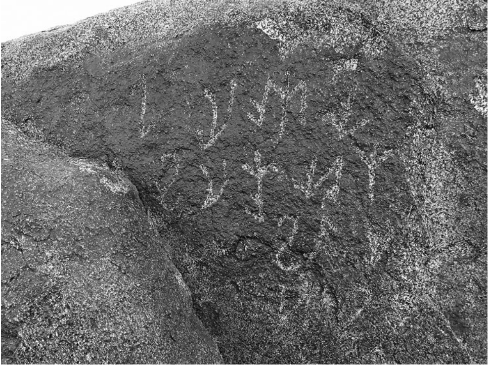
Figure 7. The first part of the second inscription in an unknown script.

began to work on the new inscription in the ‘unknown script’ and, at a conference on the new inscriptions held in Tajikistan on 1 March 2023, they announced their findings, characterising the script in the same way as Lurje but offering a key to the script that enabled them to recognise parallels in the script on the large rocky outcrop (Figure 5) with the royal name and title in the Bactrian inscription. The Cologne team had been interrogating the ‘unknown script’ since May 2021, when they started work on the Dašt-i-Nawar inscription and its cognates. This previous engagement enabled them to rapidly identify the language of the inscription as a previously unknown Middle Iranian language, related to but different from Bactrian. 9 They also showed that the same name and title together with the word Kushan could also be read in the ‘unknown script’ at Dašt-i-Nawar and recognised further titles of the king in the previously unrecorded Middle Iranian language paralleling those in the Bactrian text of the Dašt-i-Nawar inscription. The relationship between Bactrian and the language of the ‘unknown script’ proposed by Bonmann, Halfmann, and Korobzow is also evident in the solution proposed by Harry Falk, 10 based on his reading of Davary’s article, that the ‘unknown script’ is a transcription of the Bactrian.