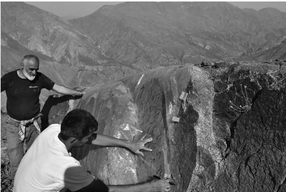
Figure 6. The National Museum of Tajikistan team documenting the inscriptions in an unknown script on the second rocky outcrop.

by other sites and was also published online with an English translation by Central Asian Archaeological Landscapes. 8