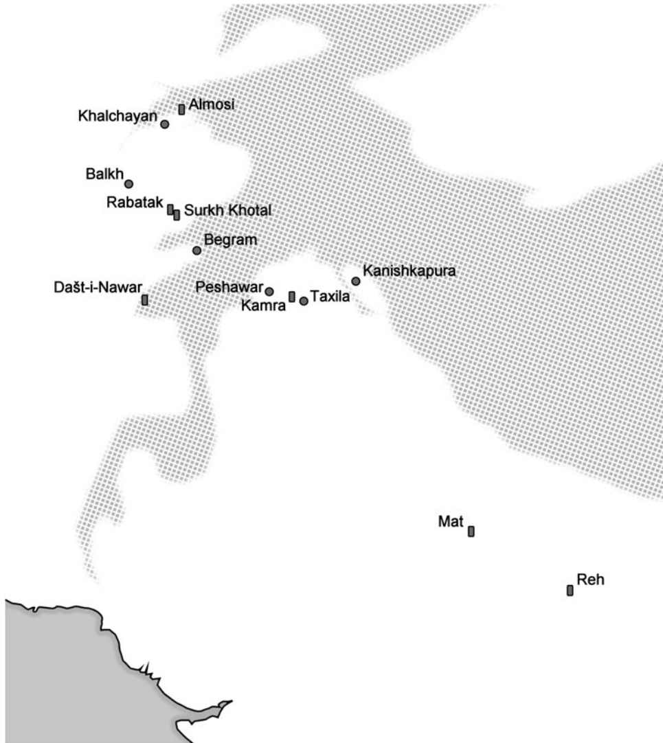
Figure 8. Map of territory included in the Kushan empire showing locations of Kushan-related sites (●) and Kushan royal inscriptions (■). Source: drawn by Robert Bracey.

Wima Takto (Figure 10). The coin and Mathura enthroned representations of Wima Takto also recall two other images of enthroned early Kushan kings at Surkh Kotal 33 and Khalchayan (Pugachenkova 1971, fig. 54), 34 suggesting that they may also be images of this king.