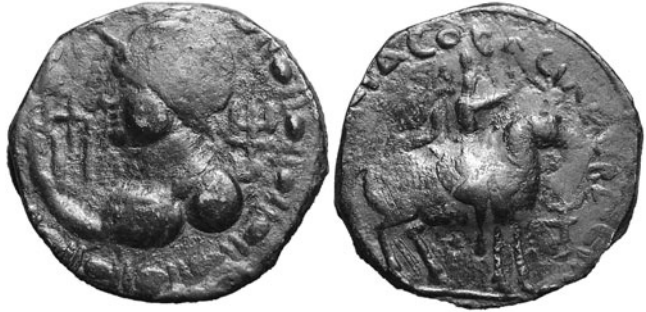
Figure 11. Coin of Wima Takto, Soter Megas type for Bactria, inscribed with his initial vi in Kharoṣṭhī on obverse and Greek O at end of reverse inscription ΒΑΣΙΛΕΥ ΒΑΣΙΛ[ΕΩΝ ΣΩΤΗΡ ΜΕ]ΓΑΣ Ο.