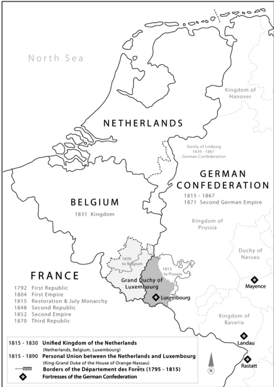
Figure 1. Territorial changes of Luxembourg during the nineteenth century. (Map designed by T. Kolnberger)