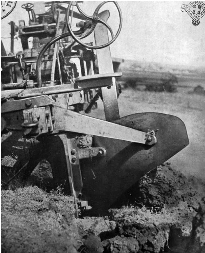
IMAGE 3: “The Soil’s Redemption,” Nazione e Impero. Rivista mensile di opere pubbliche, bonifica, colonizzazione 6 (1937-XV), cover page, held in the Biblioteca Nazionale Centrale di Roma.

redefinition of national topographies 86 informed internal colonization projects and migration flows and, particularly during the 1930s, evolved along with the colonial agenda. According to historian Alberto De Bernardi, in that decade land redemption and civilization efforts in remote areas of Italy and colonial