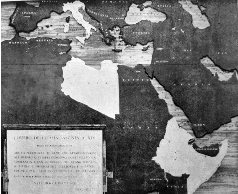
IMAGE 1: Marble map of the Italian Empire in 1936 on display, during the Fascist period, on one side of Via dell'Impero in Rome (the modern-day Via dei Fori Imperiali). Source: "La parola e l'esempio," Nazione e Impero. Rivista mensile di opere pubbliche, bonifica, colonizzazione Aprile-Maggio 4-5 (1937-XV): 4-8, 8, held in the Biblioteca Nazionale Centrale di Roma.

supported intensive programs of demographic colonization that allowed for a few dozen rural villages and the arrival of about thirty thousand white colonists. 12 It was not a coincidence that this last injection of "farmer-warriors," the so-called "army of the thirty thousand," occurred just before Italy entered World War II. Libya was the Italian, or better, Axis outpost along the African coast. 13 Despite propaganda and enormous financial resources, the Italian land transformation scheme covered at its peak an area of just 89,970 hectares out of Libya's total surface area of some 1,759,541 square kilometers. 14