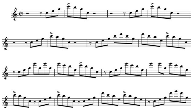
Example 1. Aaron Copland, Clarinet Concerto , clarinet part, version 1 from the autograph piano score, in concert pitch, mm. 441–456. Transcribed from: Library of Congress, Aaron Copland, Clarinet Concerto Sketches , Notated Music, https://www.loc.gov/item/copland.sketch0030/ , accessed May 3, 2022; © 1949, 1952 The Aaron Copland Fund for Music, Inc. Copyright Renewed. Boosey & Hawkes, Inc., Sole Licensee; with courtesy of Boosey & Hawkes Bote & Bock, Berlin.