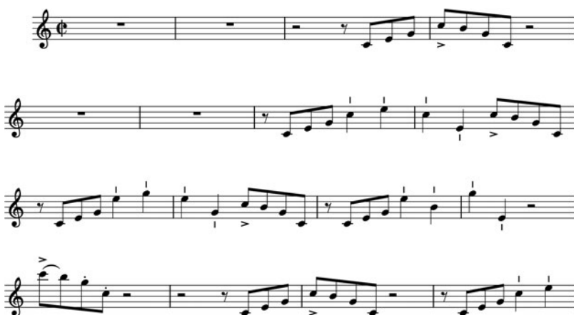
Example 2. Aaron Copland, Clarinet Concerto , clarinet part, version 2 from the autograph piano score, in concert pitch, mm. 441–456. Transcribed from: Yale University, MSS 53 Goodman Papers, box 2; © 1949, 1952 The Aaron Copland Fund for Music, Inc. Copyright Renewed. Boosey & Hawkes, Inc., Sole Licensee; with courtesy of Boosey & Hawkes Bote & Bock, Berlin.

Copland sent to Goodman, which is now held at Yale. Both music examples are notated in concert pitch, as Copland himself did.