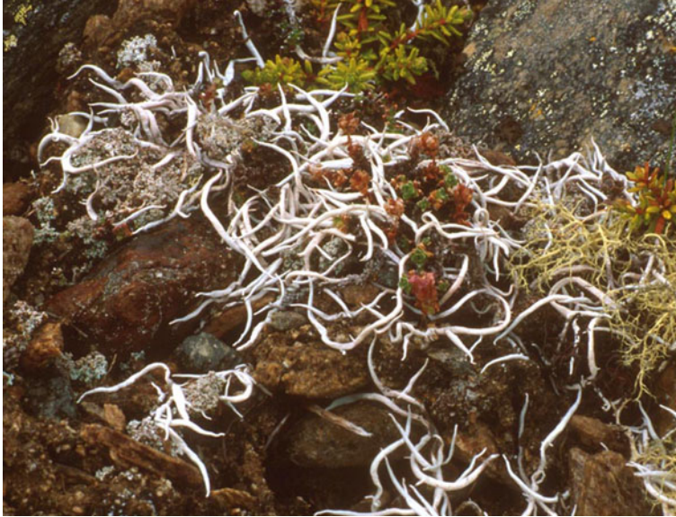
FIG. 1. Thamnolia vermicularis in the mountains in Vågå, Norway.  In colour online.

Culberson ( op. cit. ) also made several neotypifications of the names (see below).