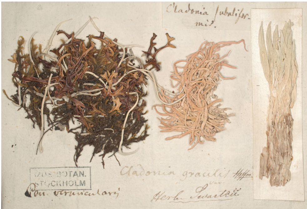
FIG. 3. The neotype designated by Culberson (1963) in Swartz' herbarium (SBT); the middle specimen is inscribed Cladonia subuliformis . In colour online.