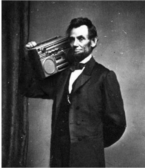
Figure 2 Abraham Lincoln with a boom box; this image was posted widely on the Internet in 2011 (original source unknown).

Despite this, I am uncertain whether anachronism itself is a very useful idea. The crux of the concept refers to an object or custom or way of thought which is out of its proper time. And this raises the question of what constitutes the ‘proper’ time for an object or thought. No doubt archaeology itself has helped to create the perceived proper temporal order for things, but more generally this is probably the legacy of modernist thinking insofar as the trope of modernity defines the very possibility of something being untimely. And this brings us back to the idea of contemporaneity as a relation to a period of time, which I discussed earlier. What makes something untimely is an idea of contemporaneity which works off the notion of the present as an era or period. For 19th-century antiquarians, archaeological remains were non-contemporary because they did not belong to the present – that is, the modern era. The present, as distinct from the past, and the modern as distinct from the ancient or premodern, are the classic chronoschisms of modernity, but they also perform the same function as any periodization: they make contemporaneity a question of belonging to a certain unit or stretch of time. This is exactly the same chronotype being played out here, as with my earlier discussion of chronology.