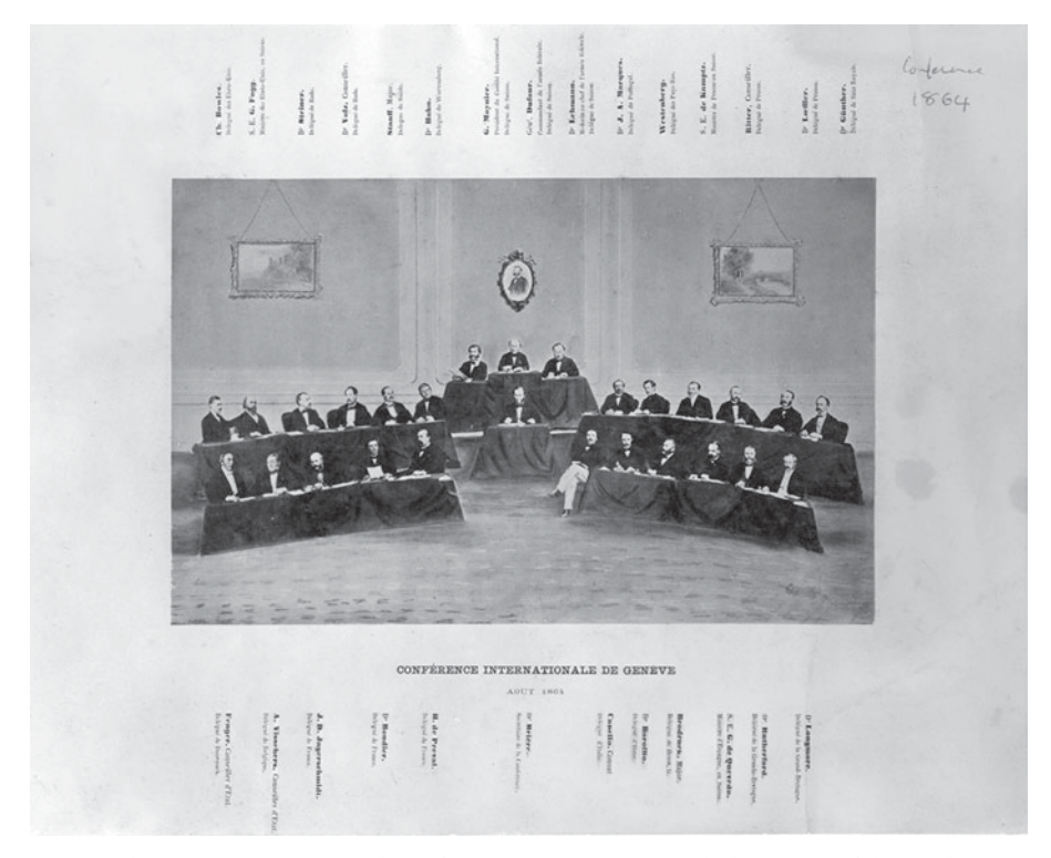
Figure 2. The Geneva International Conference, August 1864, with the names of those taking part and their countries of origin.

including 18 official delegates from 14 states,<sup>9</sup> gathered and drafted ten Guidelines which stated, among other things, the function of voluntary relief societies that were to be created as a follow-up to the meeting.