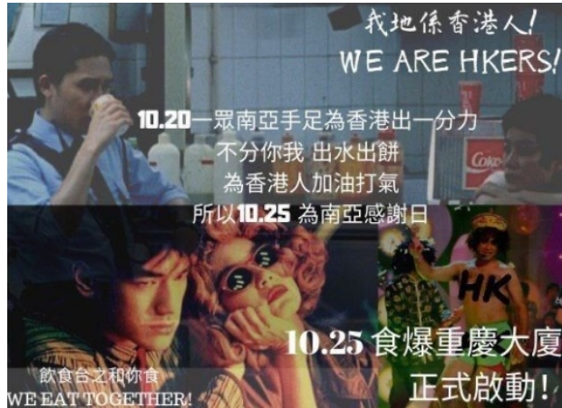
Poster circulated by Hong Kong netizens in late 2020 in response to the gestures of solidarity from the South Asian community.

Later that day, as the march drew to a close, a police water cannon fired blue dye at the mosque, even though there were no protesters in sight. The corrosive liquid not only stained the building blue, but also injured several South Asian community leaders who were standing by the gate. The police attack on the place of worship ignited anger not just from the South Asian and Muslim communities, but also from mainstream Han Hong Kong protesters. An hour later, dozens of the last gathered at the mosque to help community members clean the building’s front gate and pavement. Others posted messages on LIHKG that evening to organise a collective cleanup the next day. Afterwards, the Muslim Council of Hong Kong—an organisation that advocates for the rights of Muslim ethnic minorities in the city—circulated a drawing of black-clad protesters peacefully wiping blue stains off the gate of the mosque. At the bottom of the image was written: ‘HKer is not defined by race.’ During the Anti-ELAB Movement, protesters commonly used black garb as a tactic to evade police surveillance. Disguising individual