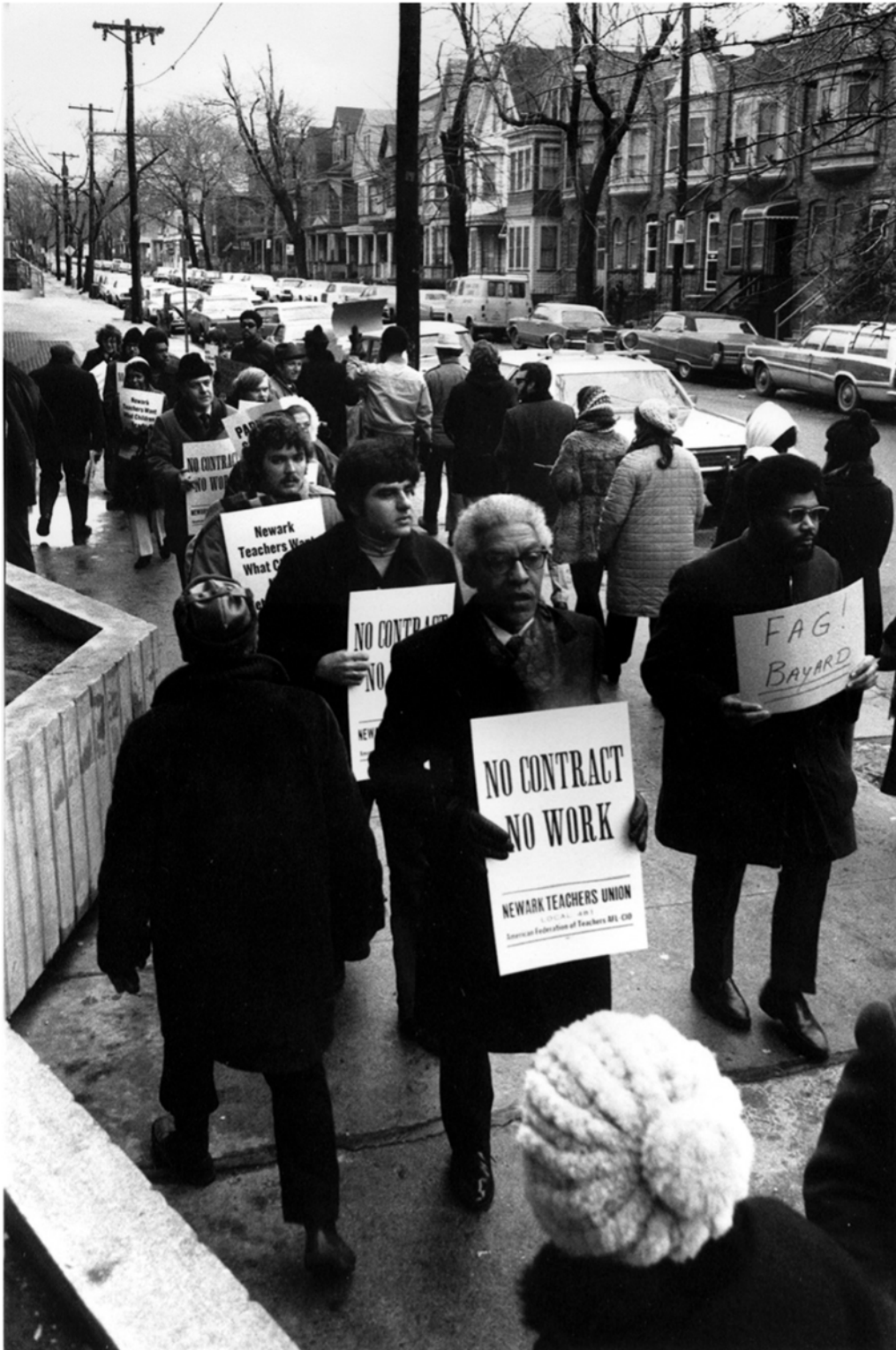
Figure 6. Bayard Rustin at the scene of a 1971 teachers' union strike in Newark, New Jersey. a