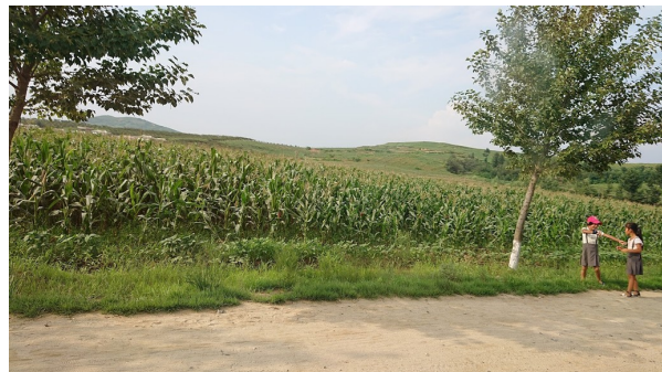
Corn fields in the countryside of DPRK

More than anything, I feel the deep-rooted hatred that Japan has for this country in the fact that while calling the southern country by its official name, the Japanese government, media, and vast majority of ordinary citizens call the DPRK not by its official name, the Democratic People’s Republic of Korea, but by the epithet “Kita Chosen,” a name rejected by the DPRK and many Zainichi Koreans.