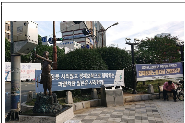
“Forced Labor” statue at a park near the Japanese consulate in Busan. (Photo by the author on July 23, 2019)

On July 22, six university students staged a protest at the Japanese consulate in Busan and were arrested, an incident that was widely reported. On a road adjacent to the Japanese consulate in Busan is a statue of a young girl erected to remember Japanese military sex slavery, and she, like the statue of a conscripted wartime laborer in a park near the consulate, faces the consulate, almost as though she is quietly watching over the events that occur there.