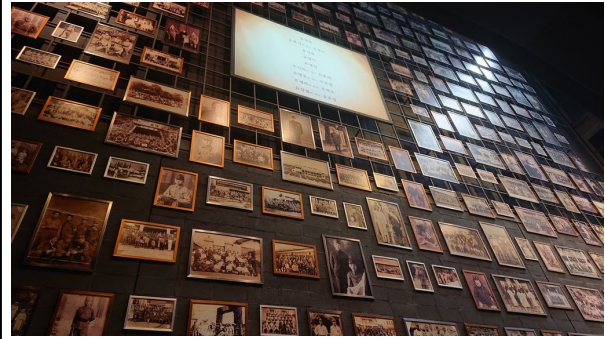
Wall to remember the victims of forced labor (Photo by the author on July 23, 2019)

The museum not only remembers the victims; it points to the perpetrators as well. At the Museum there is a list naming around 300 Japanese companies that utilized forced mobilization to grow and are still thriving today, including many major Japanese corporations such as the Mitsubishi, Mitsui and Sumitomo corporate groups. After its “liberation” following Japan’s defeat, Korea was divided in two, and more than 3 million people were killed in the Korean War that followed. The Japanese economy used this war as an opportunity for growth by means of “special procurements” whereby Japanese corporations enjoyed increased demand from the U.S. military and others involved in the war. The list of companies included the company where my father worked. Even though I have no direct responsibility for forced mobilization, I have reaped the benefits of a Japanese economy that achieved growth by trampling on the lives and dignity of the people of the Korean peninsula.