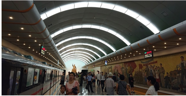
At a subway station in Pyongyang

Even now that efforts to end the war and denuclearize the Korean Peninsula have been ongoing since the Pyeongchang Olympics last year, Japan has not budged an inch in its demonization of the DPRK. This includes excluding Korean schools in Japan from the government tuition subsidy program, and even going so far as to take away souvenirs that people with roots in the DPRK bring home from their visits to the DPRK, allegedly as Japan’s own unique form of economic sanction, but truly a policy that amounts to no more than harassment. There is not a shred of remorse for Japan’s colonial rule, and its role in support of the United States in the Korean War and continued division.