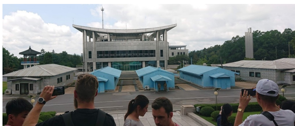
Hundreds of tourists at Panmunjom. About 80% of foreign tourists to DPRK are from China, and most of the rest are from Europe.

Even now that efforts to end the war and denuclearize the Korean Peninsula have been ongoing since the Pyeongchang Olympics last year, Japan has not budged an inch in its demonization of the DPRK. This includes excluding Korean schools in Japan from the government tuition subsidy program, and even going so far as to take away souvenirs that people with roots in the DPRK bring home from their visits to the DPRK, allegedly as Japan’s own unique form of economic sanction, but truly a policy that amounts to no more than harassment. There is not a shred of remorse for Japan’s colonial rule, and its role in support of the United States in the Korean War and continued division.