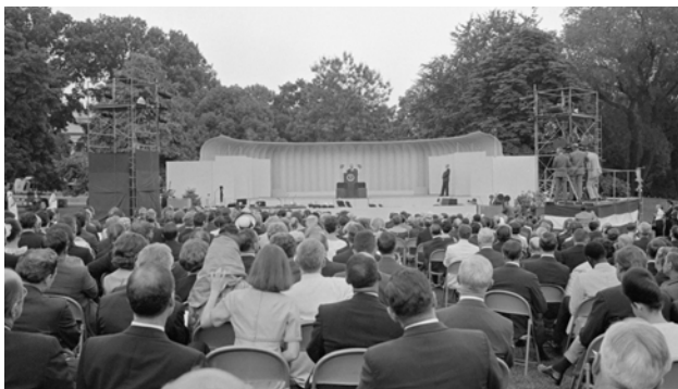
The Stage Where President Johnson Spoke at the White House Festival of the Arts.

George Kennan's speech, delivered during a luncheon for attendees at the National Gallery of Art under the title "The Arts and American Society," also revolved around the meaning of cultural freedom for artists and intellectuals in America. Kennan was an expert on international relations and the Soviet Union who is remembered for responding to the spread of Cold War communism by advocating for a policy of containment. He had little relationship to Johnson himself. In fact, Kennan once wrote that Johnson represented an "oily, folksy, tricky political play-acting" that combined a "self-congratulatory jingoism" with the "whiney, plaintive, provincial drawl and the childish antics of the grown male in modern Texas—this may be the America of the majority of the American people but it's not my America" (Quoted in Gaddis 2011, 590). Although Kennan is rarely associated with the art world, he