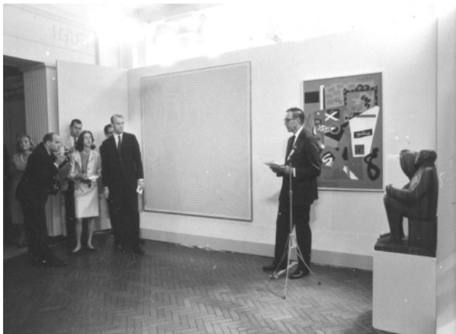
Preparations for the White House Festival of the Arts, June 13, 1965.

Keywords: Hiroshima, Cold War, Vietnam, protest, cultural freedom