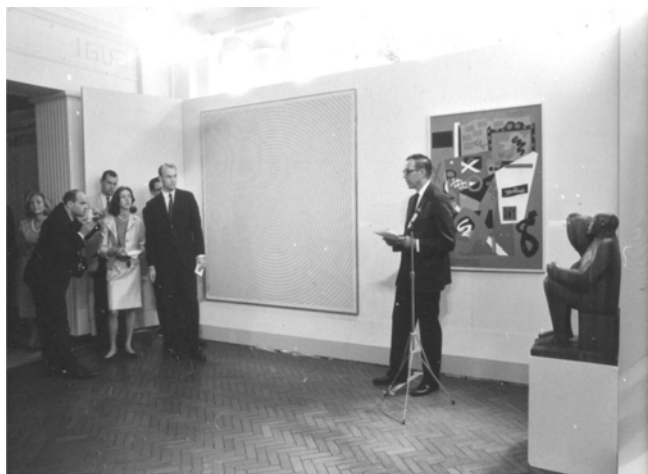
Preparations for the White House Festival of the Arts, June 13, 1965.

Keywords: Hiroshima, Cold War, Vietnam, protest, cultural freedom