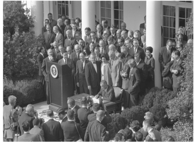
President Johnson signs the National Foundation on the Arts and Humanities Act, September 29, 1965.

President Johnson signs the National Foundation on the Arts and Humanities Act, September 29, 1965