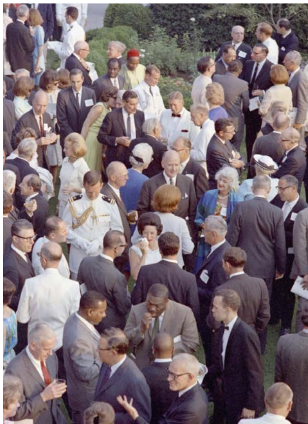
Above: White House Festival of the Arts Attendees