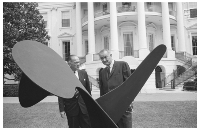
Photos above: President Lyndon Baines Johnson (on right in both photos) with Senator William Fulbright at the White House Festival of the Arts.