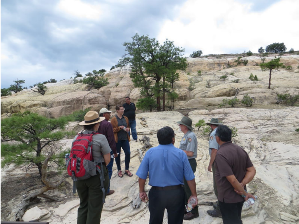
Figure 3. Tribal consultation meeting to review IRAD draft nomination on August 3, 2018 (photograph by T. J. Ferguson). (Color online)

which these places are significant in terms of both scientific significance and ongoing social and cultural importance. Note that although some historic contexts may emphasize certain data types over others (i.e., archaeological, ethnographic, documentary), they all require the convergence of many lines of evidence. Further, most IRAD properties communicate multiple historic contexts. This demonstrates not only the utility but also the necessity of a layered approach to historic contexts.