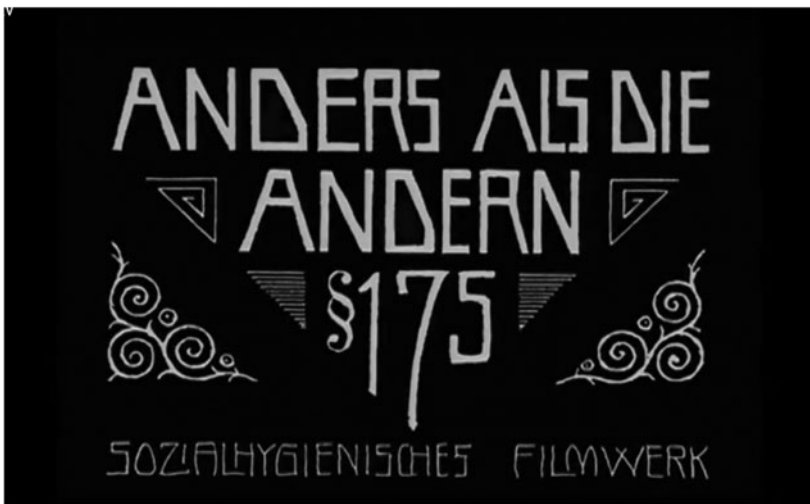
Filmmuseum München initial title card

the film within its revolutionary context. It presents the audience with a “brochure” to read, historicizing the experience.