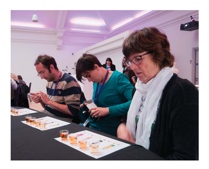
Conference participants partake in the whisky-tasting session held in the Deacon Suite within the college.