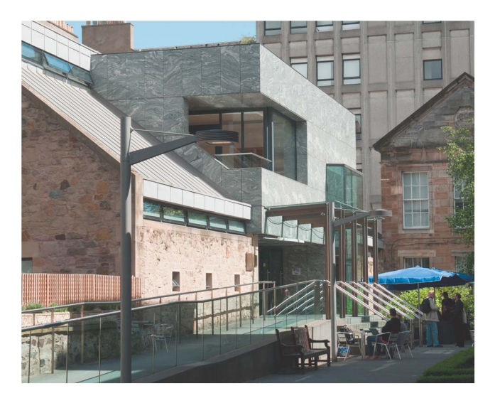
The Quincentenary Building within the Royal College, where the conference was held.