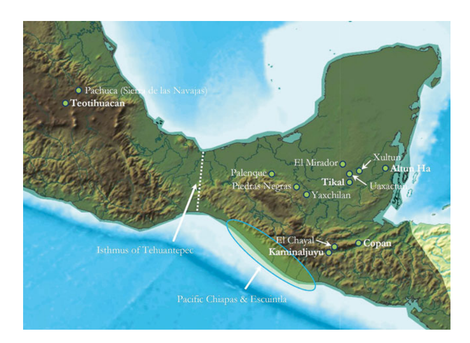
Figure 1. Map of central and eastern Mesoamerica marked with sites mentioned in the text.

'shouters' or 'proclaimers' (Martin 2020, 69; Stuart 1995, 190–91).