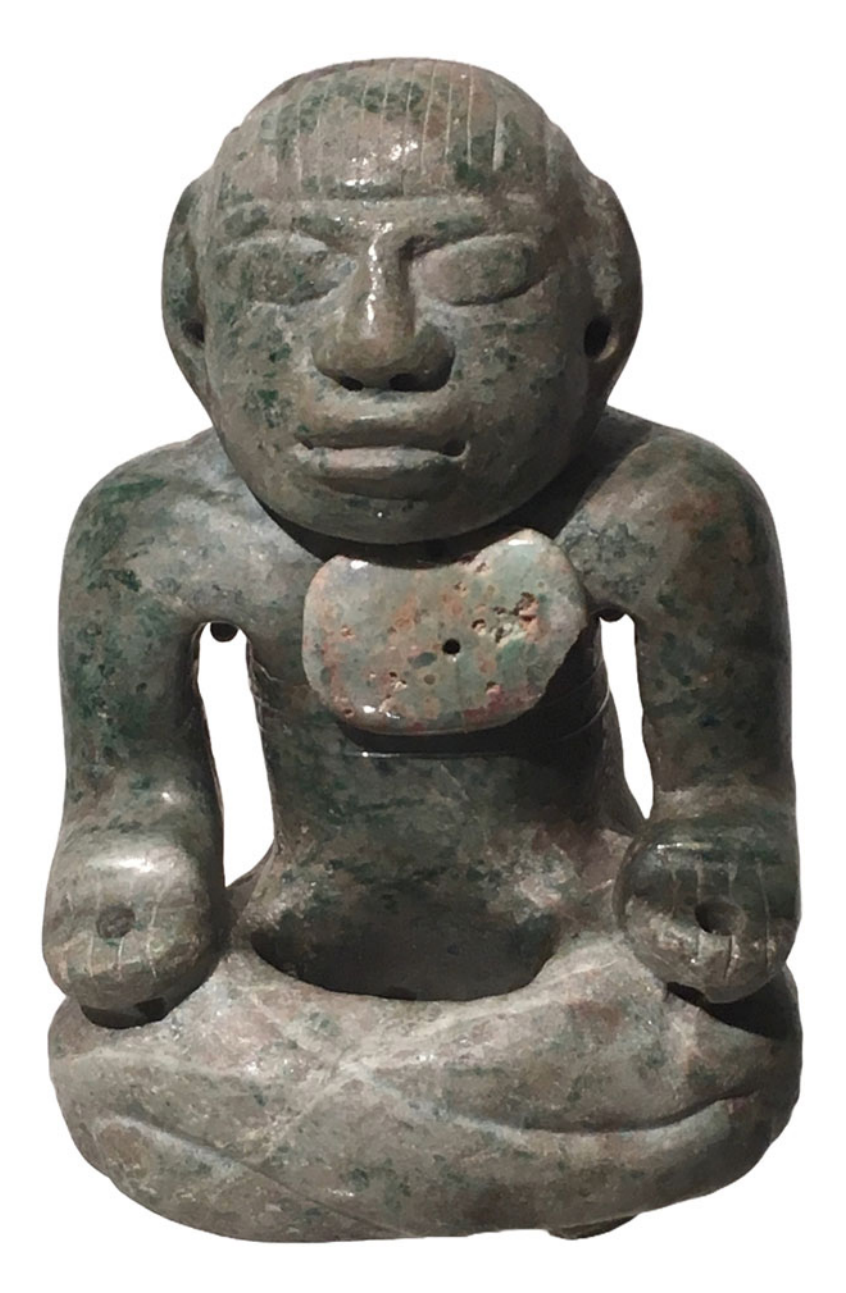
Figure 7. A jade mirror bearer, Burial 5, Temple of the Moon, Teotihuacan.

a catalyst for others. In this same interval, older forms of architecture at Tikal were successively burned, buried and razed before, in approximately 250 CE, Teotihuacan-style architecture appeared at the site. Pachuca obsidian also appeared in quantity at Maya sites for the first time. This pattern suggests that Teotihuacanos likely interacted with elite residents of Tikal during that century when the office of ajaw in its Classic manifestation began to take form.