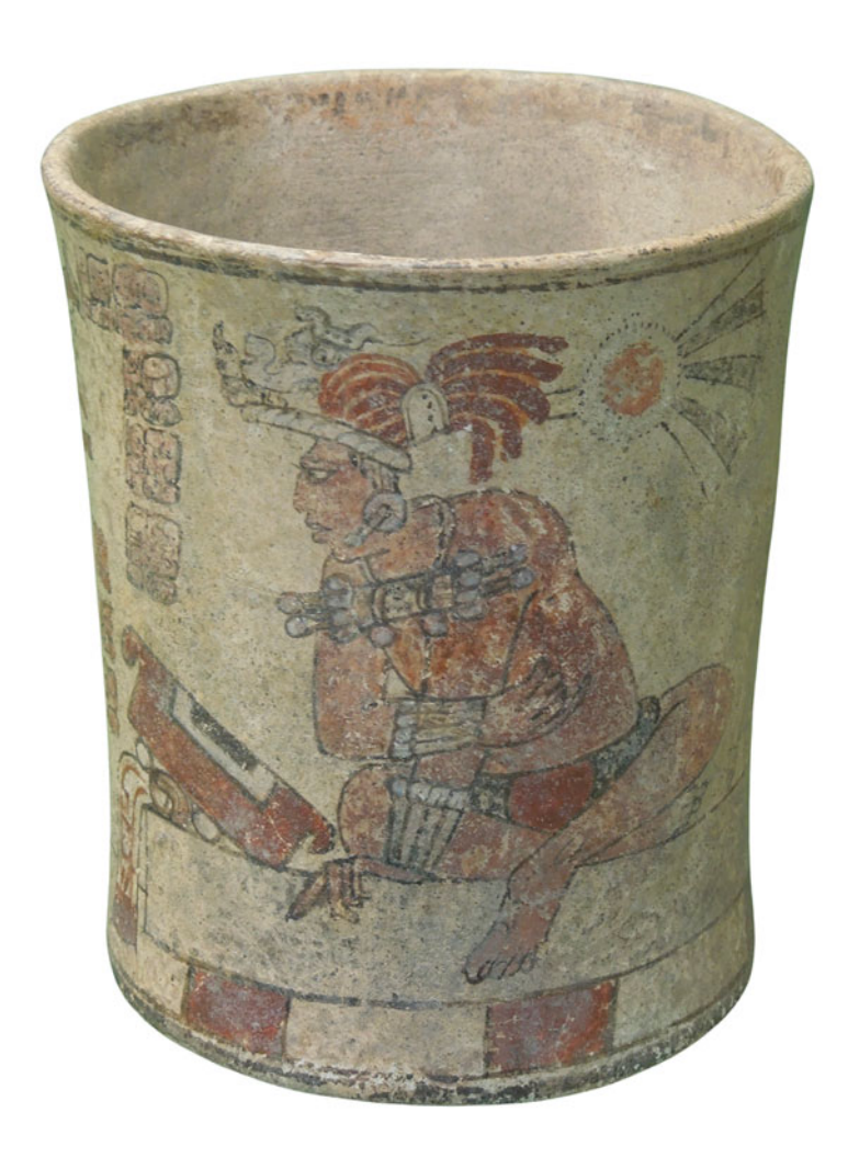
Figure 6. A Maya lord peers into an obsidian mirror on a Late Classic Maya polychrome vessel, Kaminaljuyu, Museo Miraflores, Guatemala.

acknowledgement of the 'law of superposition', the reality that within a series of sedimented layers, those layers nearest to the surface are most readably available to observation. Nonetheless, the PTP engaged in extensive trenching, often to the level of unmodified earth, and changes to the accumulation of obsidian in Tikal's archaeological record on this scale are unlikely to reflect this principle alone.