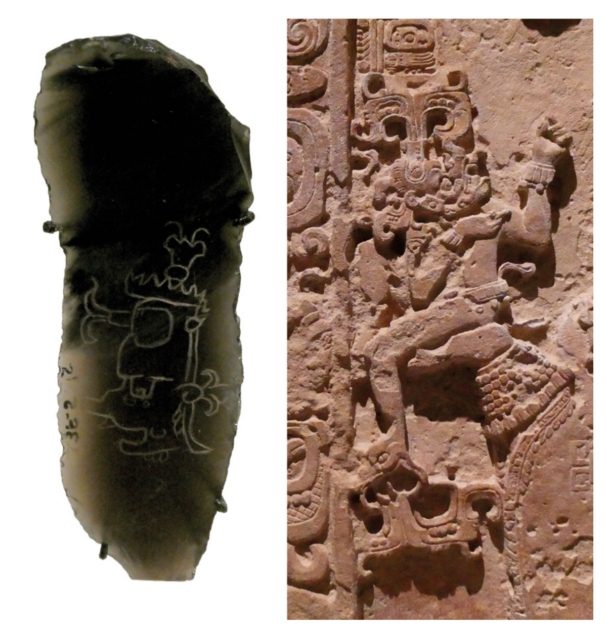
Figure 3. K'awiil, the Maya patron deity of lightning and royal dynasties. (Left) obsidian flake incised with an image of K'awiil; (right) K'awiil held in the palm of an elite Maya lady.

deity embodiment, they were attended by ranked courtiers called Taaj , 'obsidian' (Saturno et al. 2017), and Yaxchilán's Lintel 25 incorporates a text that, in an inscription concerning dynastic legitimacy, bloodletting and K'awiil, is written primarily in inverted reverse, as if viewed upon a mirror's face (Fig. 4) (Matsumoto 2012). This sculpture shows two Maya elites, one of whom emerges dressed as a Teotihuacan warrior from one head of a bicephalic serpent or centipede. At their deaths, mourners placed gleaming pyrite encrusted plaques of a sort associated with Teotihuacan (Kovacevich 2016;