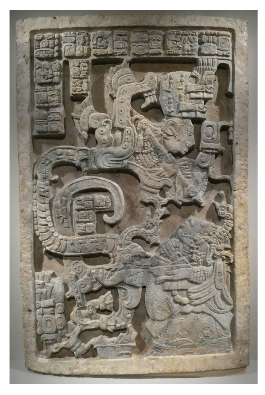
Figure 4. Lintel 25, Yaxchilán.

of the Peten Basin, and particularly Tikal. Some earlier scholarship has regarded the appearance of Initial Series calendrical notations in the area as the signal diagnostic development of the epoch. Tikal's Stela 29 incorporates the earliest known notation of this kind, 8.12.14.8.15 13 Men 3 Zip, or 6 July 292 CE (Shook 1960). However, considering Tikal's ceramic evidence, W. Coe remarked,