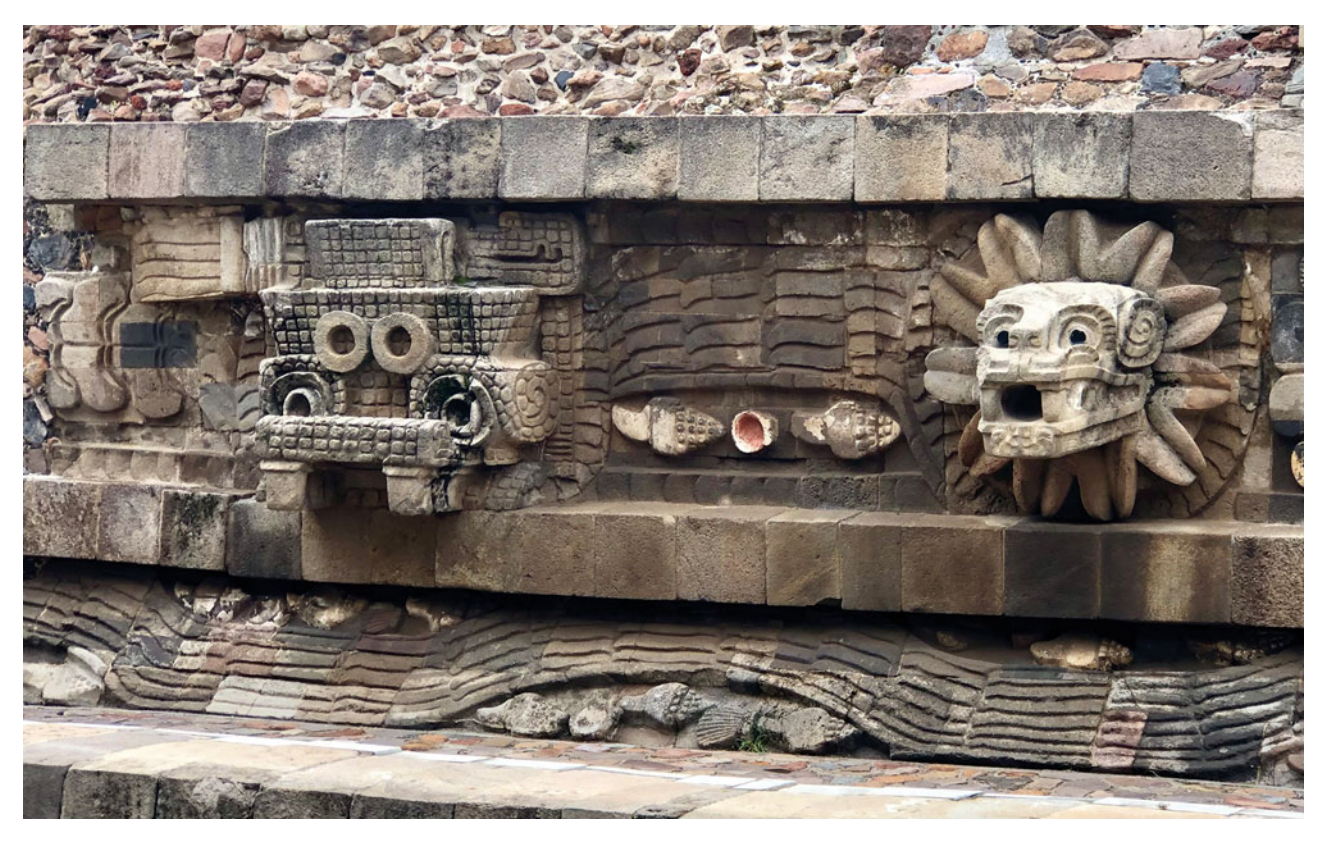
Figure 2. Tenon heads of the Pyramid of the Feathered Serpent, Teotihuacan.

that cohered with the building of Teotihuacan's Temple of the Feathered Serpent. These findings suggest that the ajawtaak occupied a unique positionality in Early Classic Mesoamerican society that was neither essentially Teotihuacan nor essentially Maya, but a dynamic syncretism of the two ethnicities that was indispensable for the refinement of indigenous Mesoamerican understandings of each.