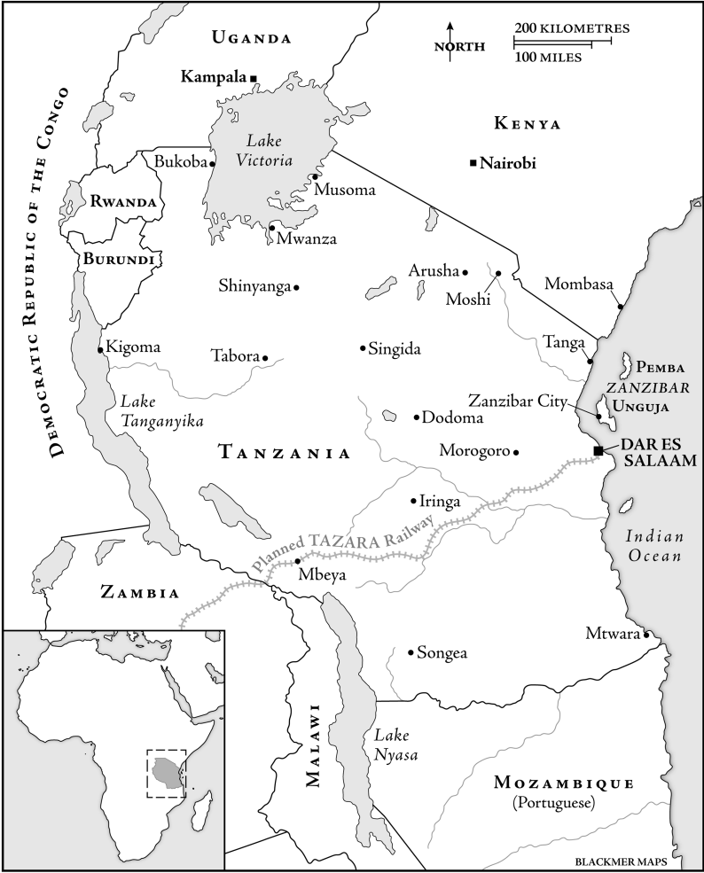
Map 1.1 Tanzania and its neighbours, circa 1968. Map by Kate Blackmer.