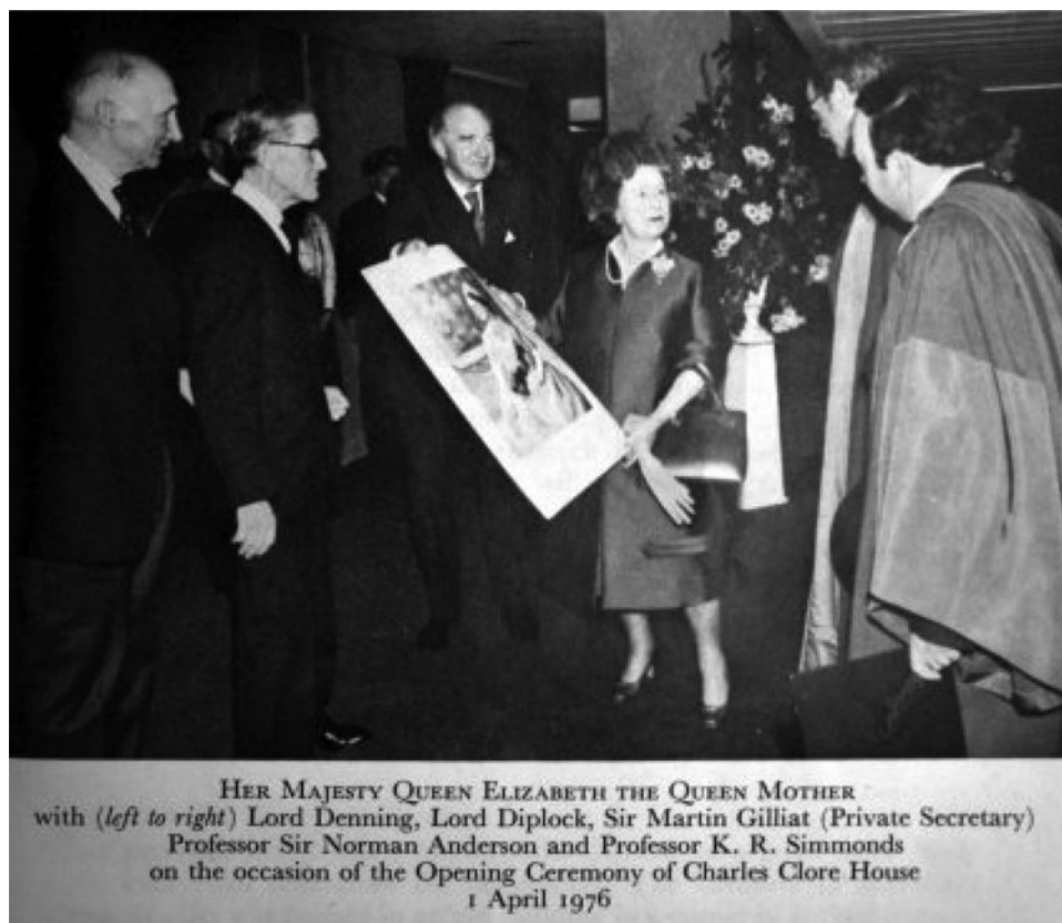
Figure 2. The official opening of the new building in 1976.

By 2016 the IALS Library was registering over 5,200 members a year. PhD students, researchers and academics were still in the majority, but other key user groups had become important such as the 2,000 LLM