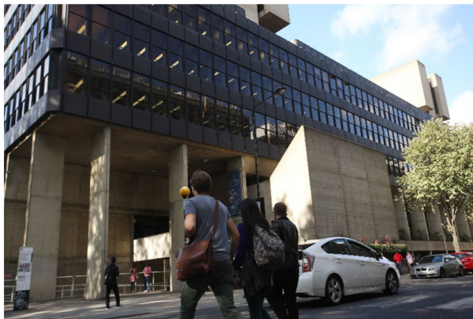
Figure 3. The exterior of 17 Russell Square.

students registered at the major University of London colleges. These were Birkbeck, King's College London (KCL), the London School of Economics (LSE), Queen Mary (QM), the School of Oriental and African Studies (SOAS) and University College London (UCL), as well as the 100 LLM and PhD students registered at IALS itself. By this time the Library's foreign, international and comparative research collections had grown to over 312,000 volumes and included a unique specialist legal education archive. Like many other research libraries, IALS Library was also subscribing to increasing numbers of commercial legal research databases, eJournals and eBooks which it made available to users via its online catalogue. This growth in admissions and specialist collections was ultimately recognised in a concordant between the British Library and IALS Library whereby the British Library explicitly acknowledged that our extensive legal research collections "are a major national resource in support of academic research in their field".