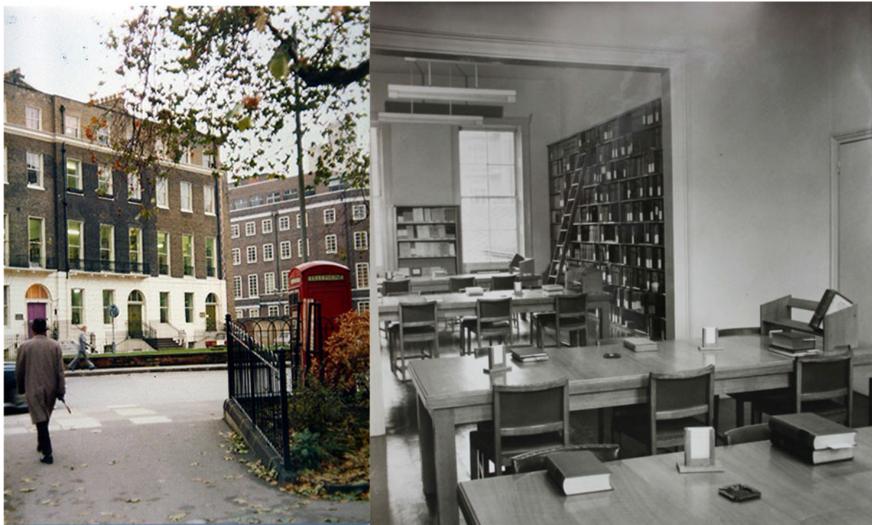
Figure 1. Exterior and interior of 25 Russell Square.

On closer inspection of the photograph of the interior of 25 Russell Square (figure 1, below) you might just notice the square ashtrays sitting on the library desks. This was no accident as it is interesting to note that