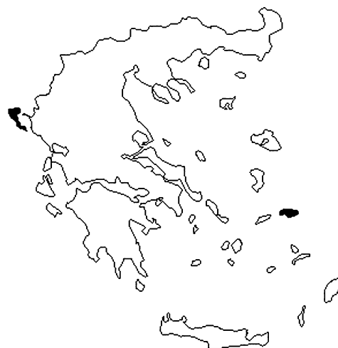
Fig. 1 Study setting: the island of Corfu is situated on the upper western border of Greece and the island of Samos is on the eastern border

Subjects' height was measured with a stadiometer and their weight with an analogue scale that was calibrated regularly (Seca 789). All anthropometric measurements were taken in morning hours (08.00–11.00 hours), in school, by the same experienced physicians. Body fat was not measured, as most participants felt embarrassed to undress in front of their classmates. Data were compared with the latest growth curves for US children (4) , as growth