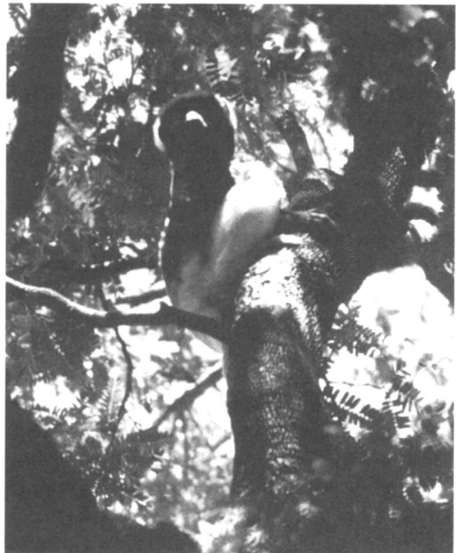
Figures 2a and 2b. P. v. deckeni , melanistic form (D. J. Curtis).