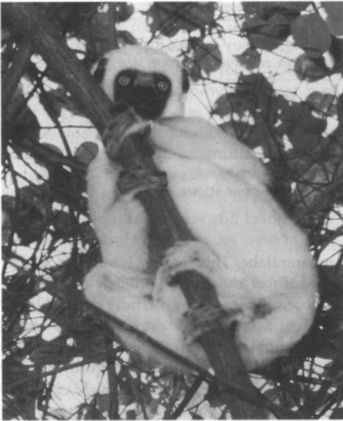
Figure 2d (above). P. v. deckeni , pure white form (D. J. Curtis).