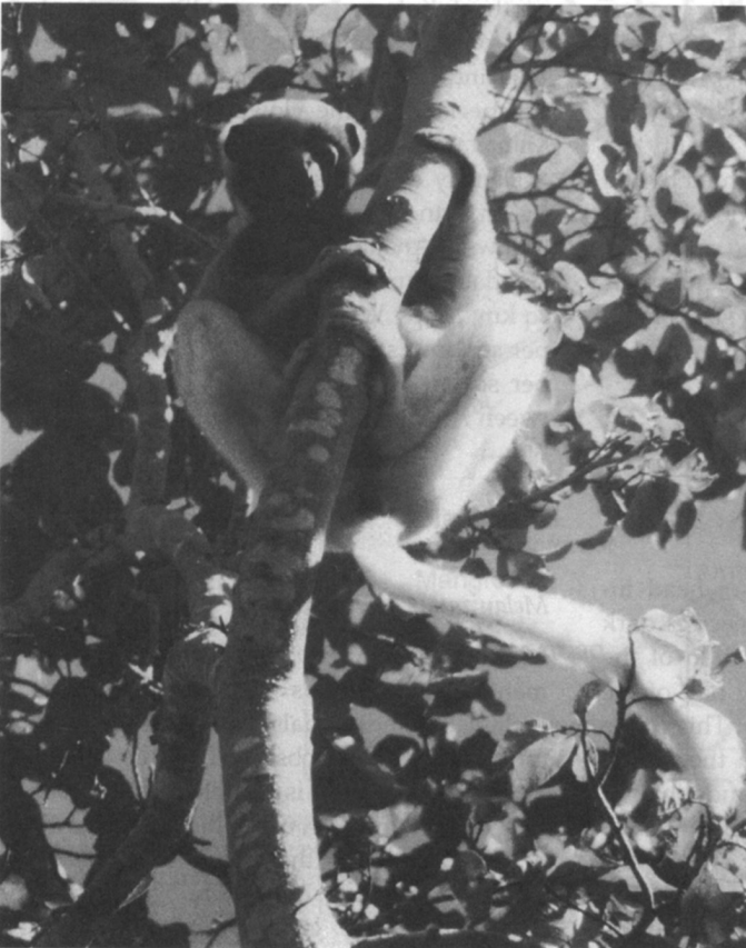
Figure 2c. P. v. deckeni , lighter melanistic form (D. J. Curtis).