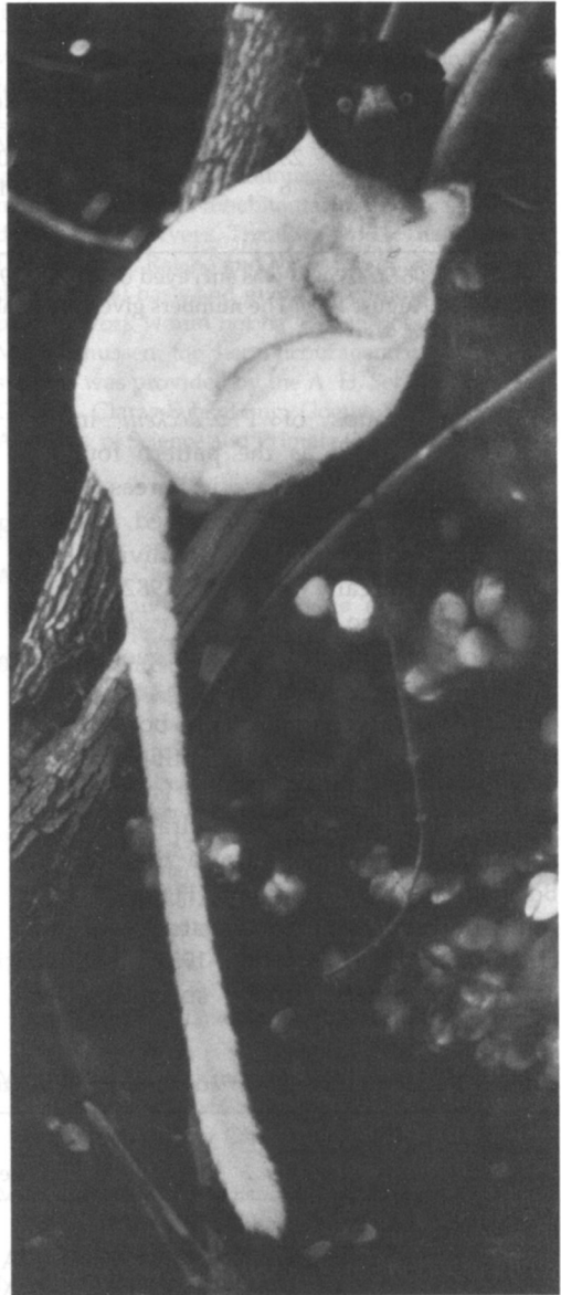
Figure 2e (right). P. v. coronatus.