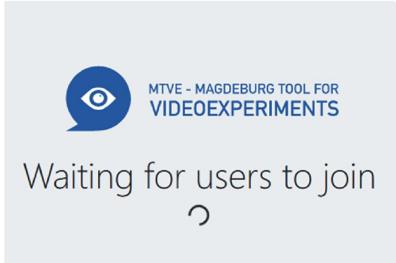
(b) Creating room as experimenter (c) Waiting screen for participants until everyone joined