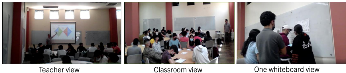
Figure 2. Three angles recorded during each class session, at the same time

Once the instrument was developed and the six facilitators accepted being observed during their DT classes, the following steps were followed: First, one classroom was chosen to set up three cameras, which would record the classes from three different angles (Figure 2). One camera pointed to the facilitator's desk, another one was set up at one corner to record the whole classroom, and a third one pointed to one whiteboard to closely record the work of one student team during the class. All the cameras were set up before each class started, and they did not interfere with the class delivery. Also, a professional mini wireless Lavalier microphone was available to capture the facilitators' voice clearly (all facilitators used it in all recorded sessions). Next, before the semester started, the participants' classes were assigned to that classroom.