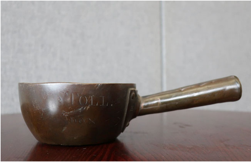
Figure 1. Copper dish used to collect toll corn in Guildford's market, late sixteenth or early seventeenth century, Guildford, Surrey. While the majority of the text engraved on the dish has worn over time, 'TOLL' and 'DON' remain legible.