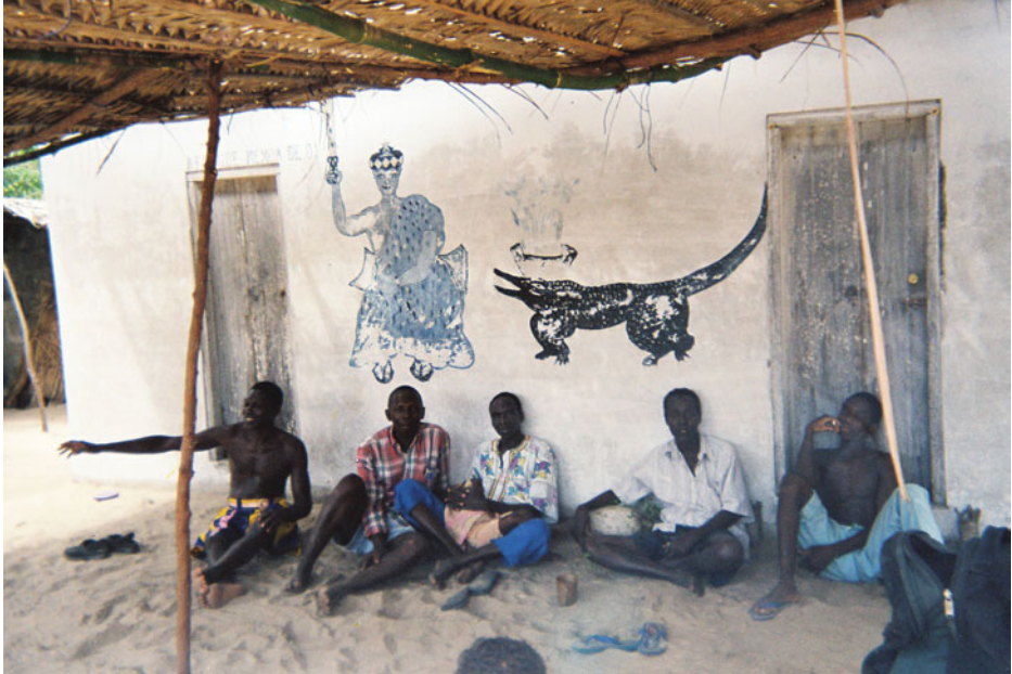
Fig. 2. A typical household shrine in Anlo-Afiadenyigba, belonging to a Fofie worshipping lineage that formerly owned slaves, depicting the divinities (both imagined and real) of the peoples they once enslaved (photo: Meera Venkatachalam, August 2005).