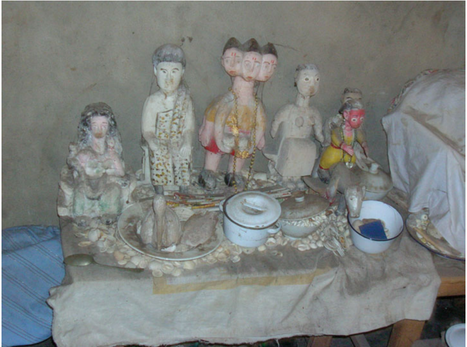
Fig. 3. Krachi Dente/Fofie shrine in Nyerwese (photo: Meera Venkatachalam, August 2003).