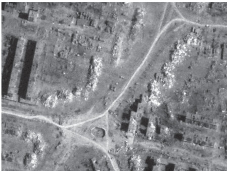
Figure 2: After Russian occupation on 16 March 2000.

potential war crimes, there are also multiple cases where it provided inconclusive, ambiguous, and sometimes misleading or erroneous results which have generally gone underreported, creating a distorted perception of the overall efficacy of space technology, and consequently raising unrealistic expectations within the international humanitarian community.