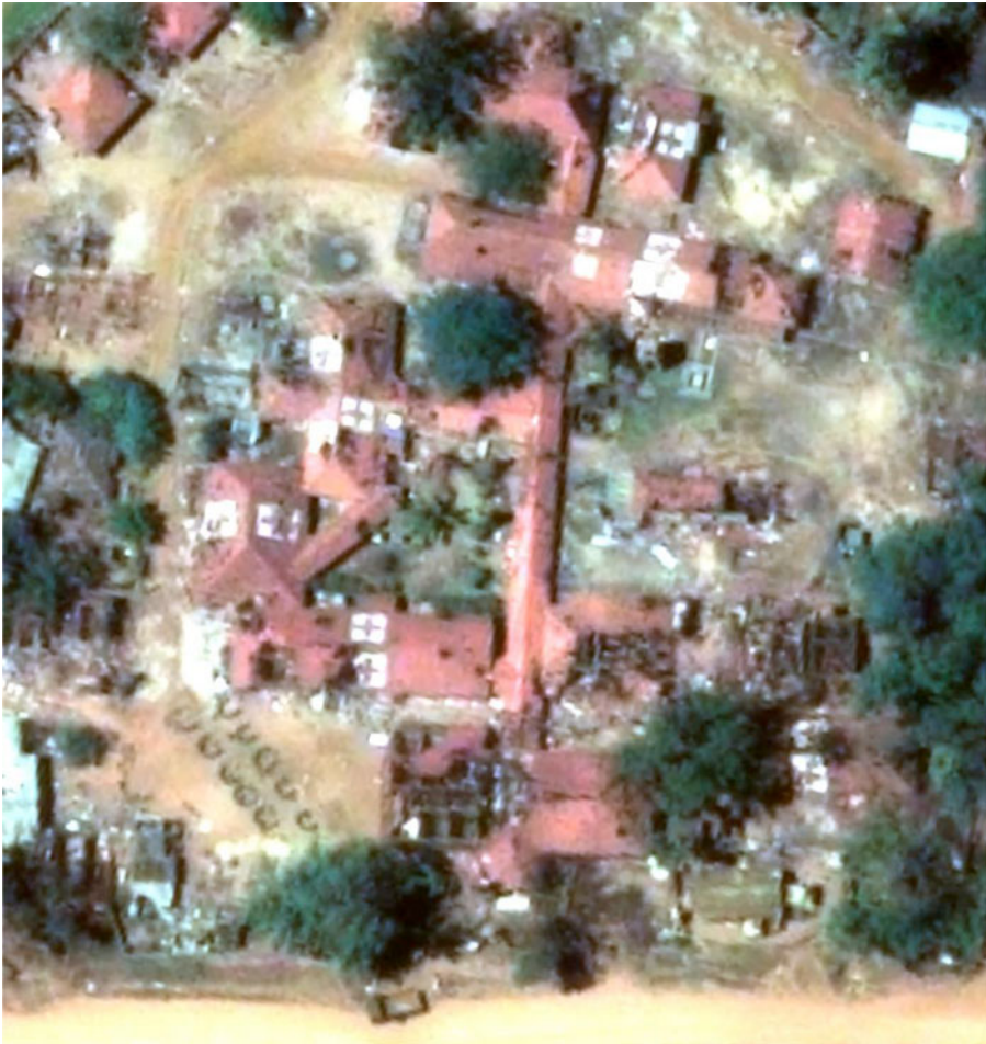
Figure 8: PTK hospital (partially destroyed) with Sri Lankan army mortar battery visible on hospital grounds in lower left (17 June 2009) (Image © GeoEye).