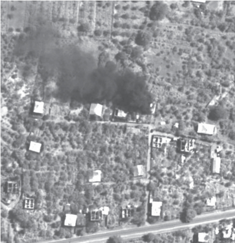
Figure 4: Residential building on fire after arson attacks in village of Kurta, South Ossetia.

For the majority of these identified building damages, specifically those damages located outside of the main urban extent of Tskhinvali, it was generally possible to attribute the damage to a specific military force, with a limited risk of conflating these damages with those resulting from different military forces. The arson-related building damages concentrated to the north and east of Tskhinvali were confidently attributed to South Ossetian militias engaged in a widespread campaign to cleanse the region of ethnic Georgian residents.