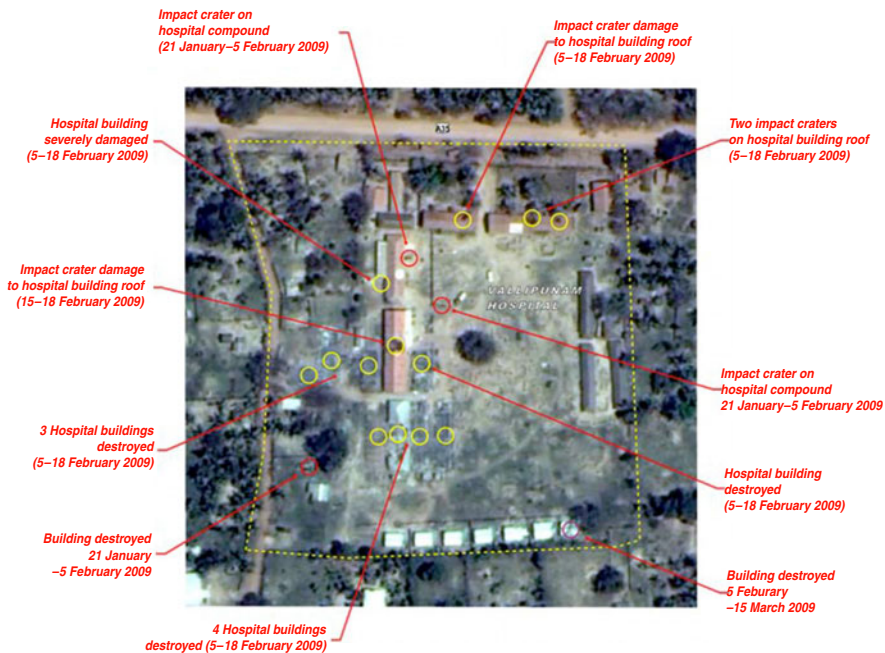
Figure 7: Satellite-based damage assessment for Vallipunam hospital, Sri Lanka.

with rooftop medical insignia visible from the air, 42 or easily distinguished as protected cultural sites by the distinctive building architecture. As shown in Figure 7, the assessment provided to the Panel of the damage to the Vallipunam hospital located on the southern edge of the first NFZ-1 clearly indicated the compound had been heavily damaged by artillery shelling and on multiple dates. 43