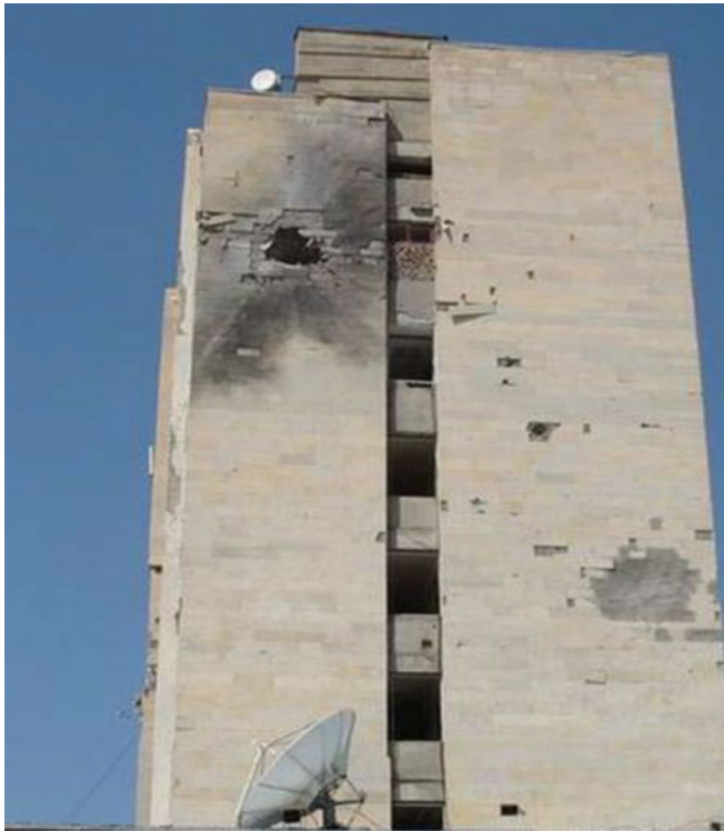
Figure 5: Ground photo of damaged building with side impact crater, Tskhinvali (September 2008), (photograph courtesy of NGO Caucasia).

approach similar to that used by the Goldstone Mission on Gaza, the Panel drew upon the analysis of satellite imagery for corroboration of individual testimonies related to the shelling of protected sites. The Panel also looked to the imagery analysis to provide, when possible, primary analysis on force attribution for the shelling of areas within the NFZs that were populated with thousands of civilians at the time.