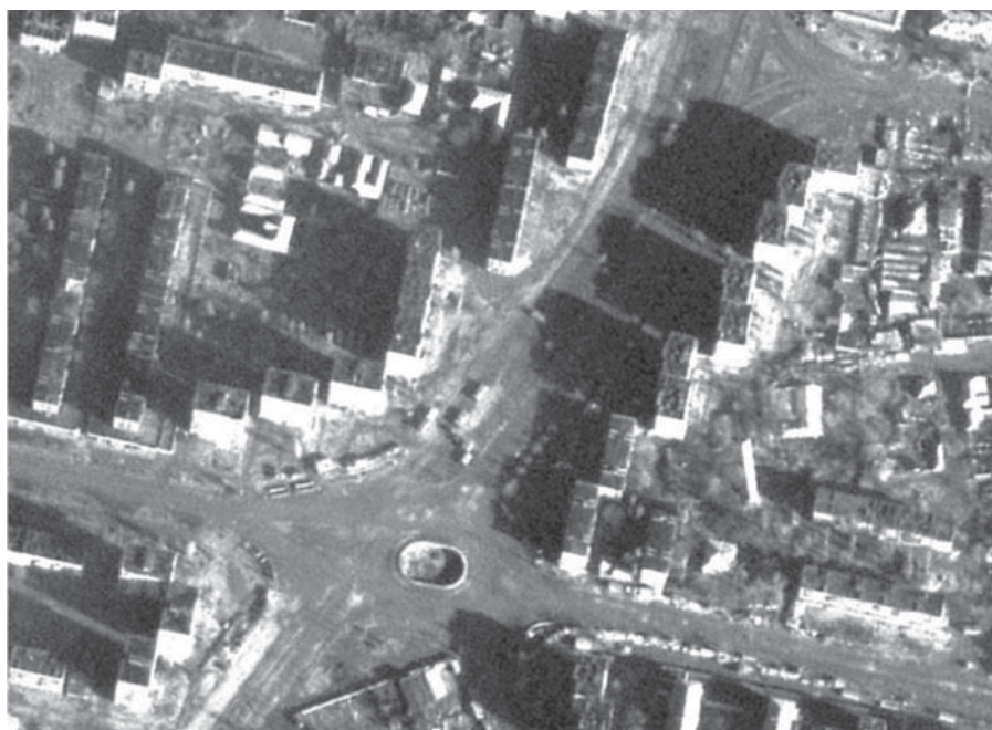
Figure 1: Central Grozny (Minutka Sq.) on 16 December 1999.

Over the last thirteen years the number of commercial and dual-use 4 satellite sensors has rapidly grown to over ten, providing a remote monitoring and analytical capacity which has been successfully employed in a modest but growing number of cases, covering the full conflict spectrum from traditional inter-state and civil wars, to cases of counterinsurgency and organized intercommunal violence.