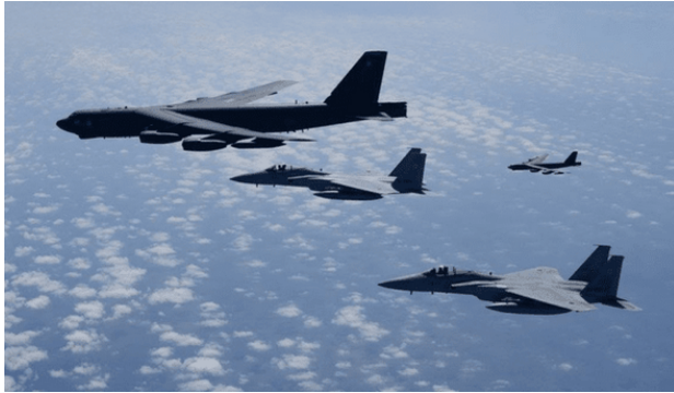
U.S. B-52 bombers over the South China Sea.