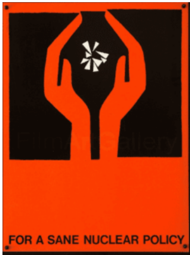
Handbill for original SANE group.

The new committee derives its name from the now-defunct National Committee for a SANE nuclear policy , an organization advocating for nuclear disarmament that was co-founded in 1957 by Norman Cousins, the editor of The Saturday Review who brought survivors of the atomic attacks on Hiroshima and Nagasaki to the U.S. for medical treatment.