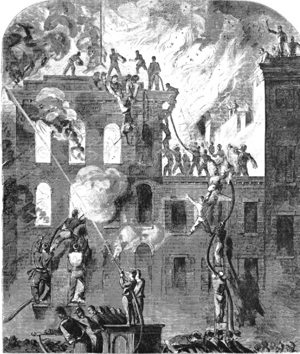
WILLARD'S HOTEL, WASHINGTON, SAVED BY THE NEW YORK FIRE ZOUAVES—DRAWING BY OUR SPECIAL ARTIST.—[See Page 20.]