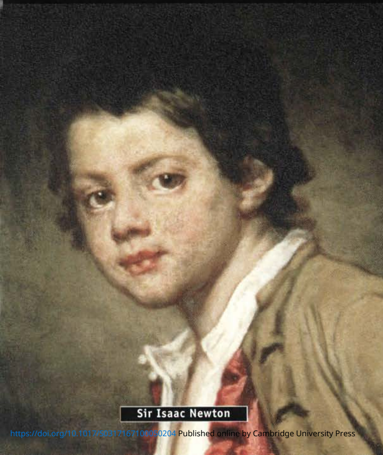
Sir Isaac Newton

YESTERDAY, PEOPLE WITH EPILEPSY HAD TO BE EXTRAORDINARY TO SUCCEED.