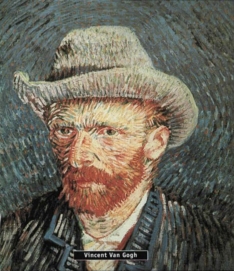
Vincent Van Gogh