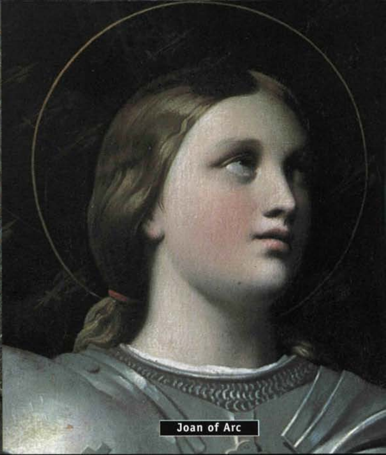
Joan of Arc

YESTERDAY, PEOPLE WITH EPILEPSY HAD TO BE EXTRAORDINARY TO SUCCEED.