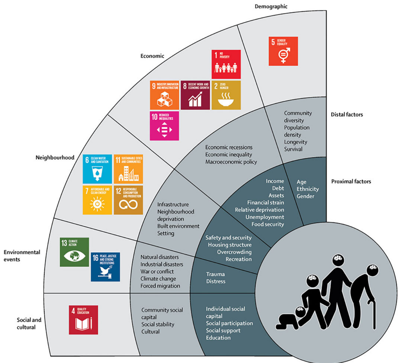
Figure 1. Social determinants of mental disorders and the Sustainable Development Goals: a conceptual framework by Lund et al. (2018).

While Lund’s framework was previously used in a review of national-level interventions, evidence presented was mostly observational and from higher or upper-middle income countries (Shah et al., 2021). Using the same conceptual framework, we aimed to strengthen the evidence base by conducting a systematic review of reviews including Lund et al. (2018) and Rose-Clarke et al. (2020) et al.’s proposed intervention priorities, with evidence