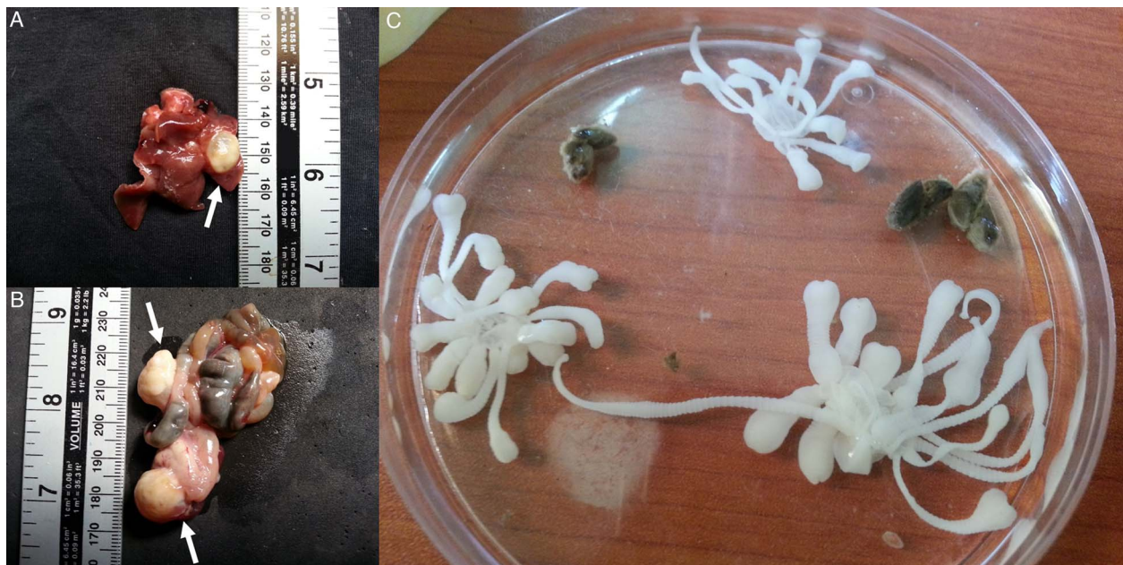
Fig. 1. Cysts containing polyecephalic strobilocerci of Hydatigera parva (indicated by white arrows) isolated during the post-mortem of a Hubert's multimammate mouse ( Mastomys huberti ) before (A, B) and after (C) dissection in a 90 mm diameter Petri dish.