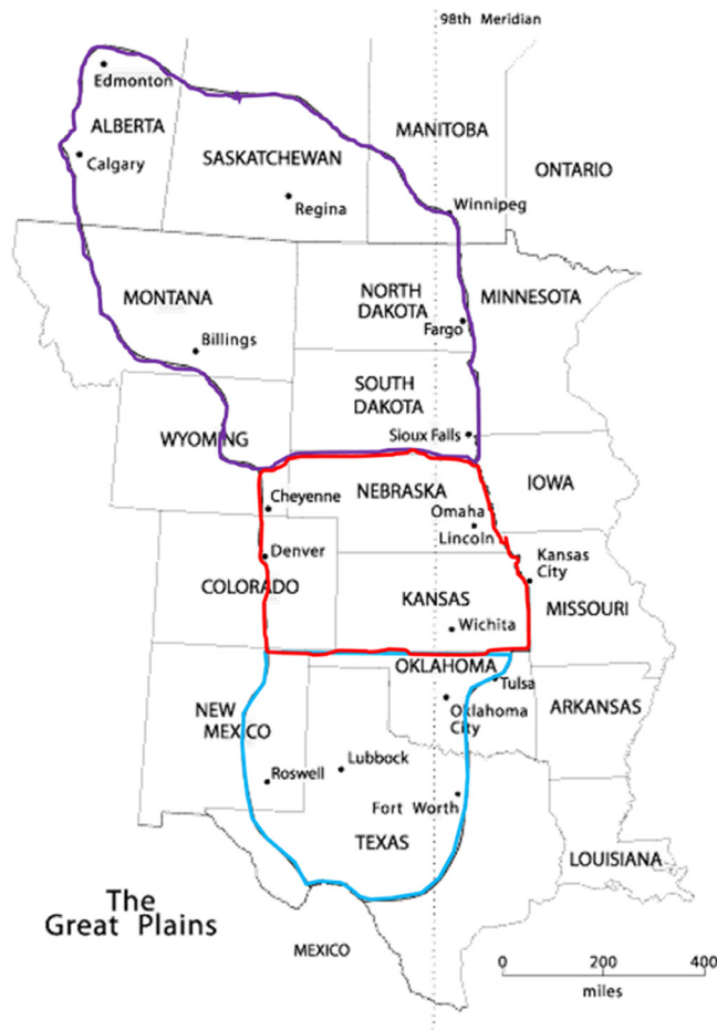
Figure 1. Map of the Great Plains showing three main regions: (1) Northern Great Plains (marked by purple line), (2) Central Great Plains (marked by red line), and (3) Southern Great Plains (marked by light blue line). Adapted from Center for Great Plains Studies, University of Nebraska–Lincoln.